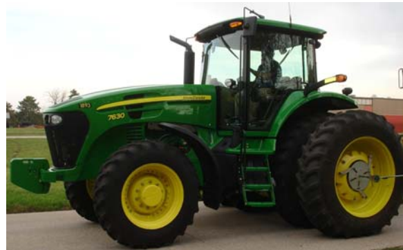
JOHN DEERE 7630 DIESEL