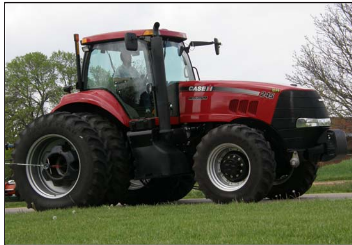
CASE IH MAGNUM 245 DIESEL