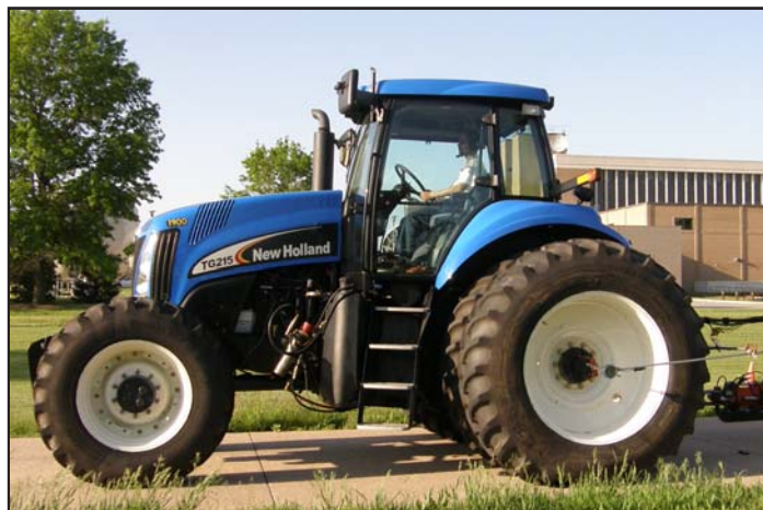
NEW HOLLAND TG215 DIESEL