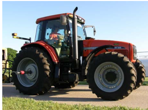
AGCO RT 120A Diesel