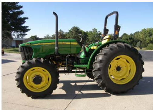
JOHN DEERE 5625 DIESEL

Institute of Agriculture and Natural Resources University of Nebraska-Lincoln