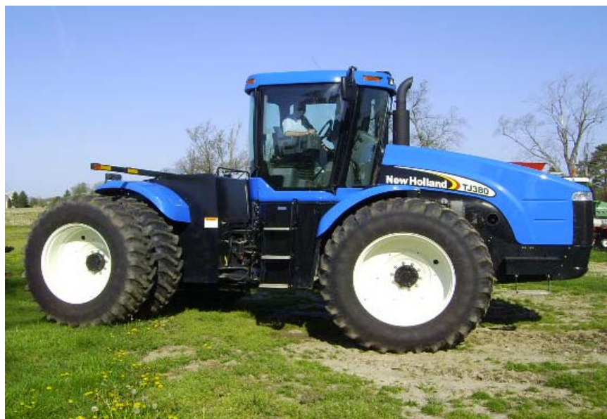
New Holland TJ380 Diesel

Institute of Agriculture and Natural Resources University of Nebraska-Lincoln