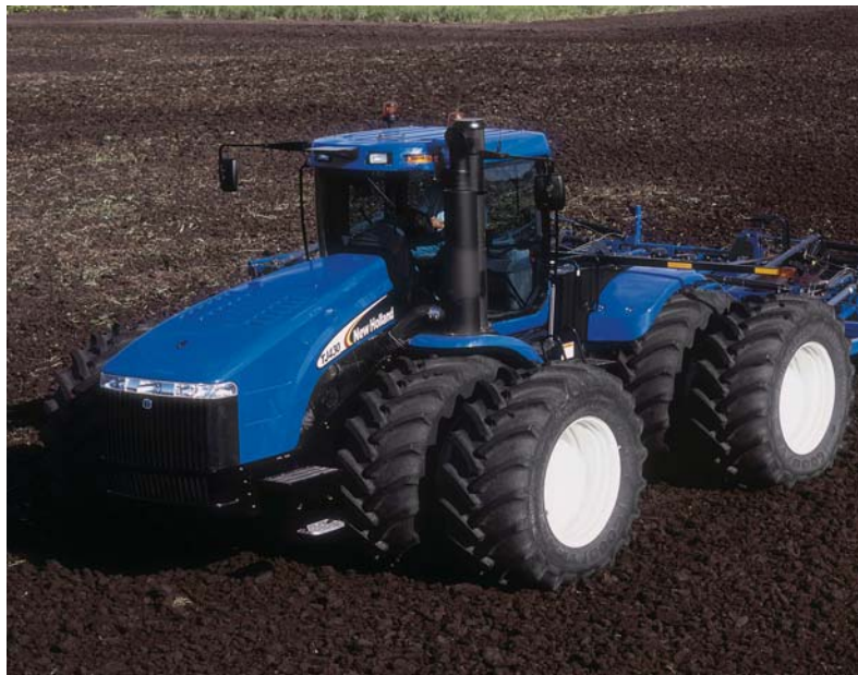
New Holland TJ 430 Diesel

Institute of Agriculture and Natural Resources University of Nebraska-Lincoln