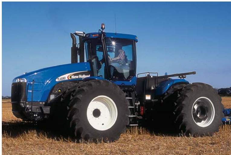
New Holland TJ 480 Diesel

Institute of Agriculture and Natural Resources University of Nebraska-Lincoln