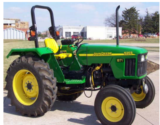
John Deere 5203 Diesel