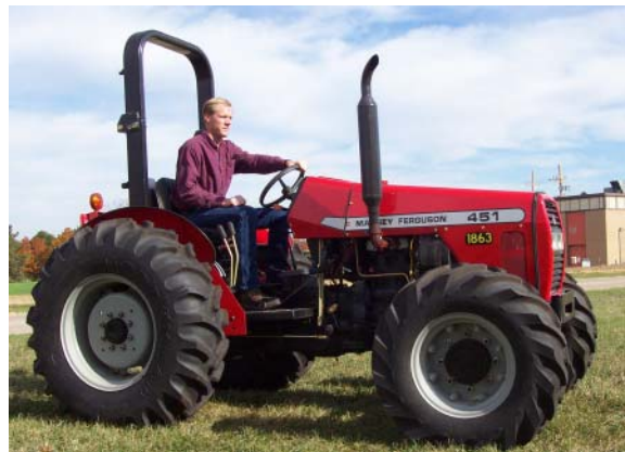
MASSEY FERGUSON 451 Diesel

Institute of Agriculture and Natural Resources University of Nebraska-Lincoln