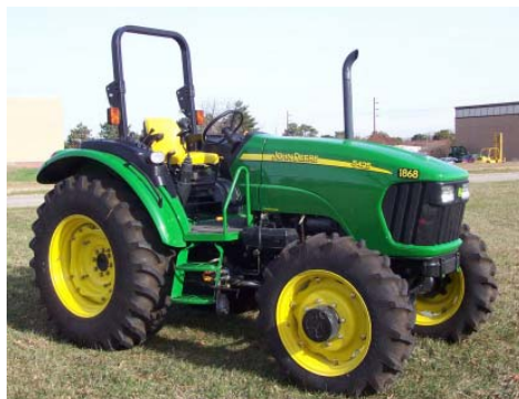
JOHN DEERE 5425 DIESEL