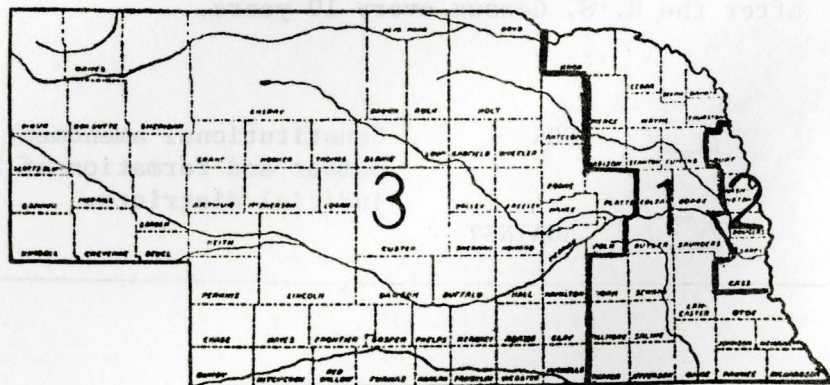
Proposed--Supreme Court Districts would follow Congressional District boundaries. Two judges elected from each district.