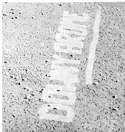
Native grass pasture badly infested with downy brome. The word "downy brome" was written by applying Atrazine.