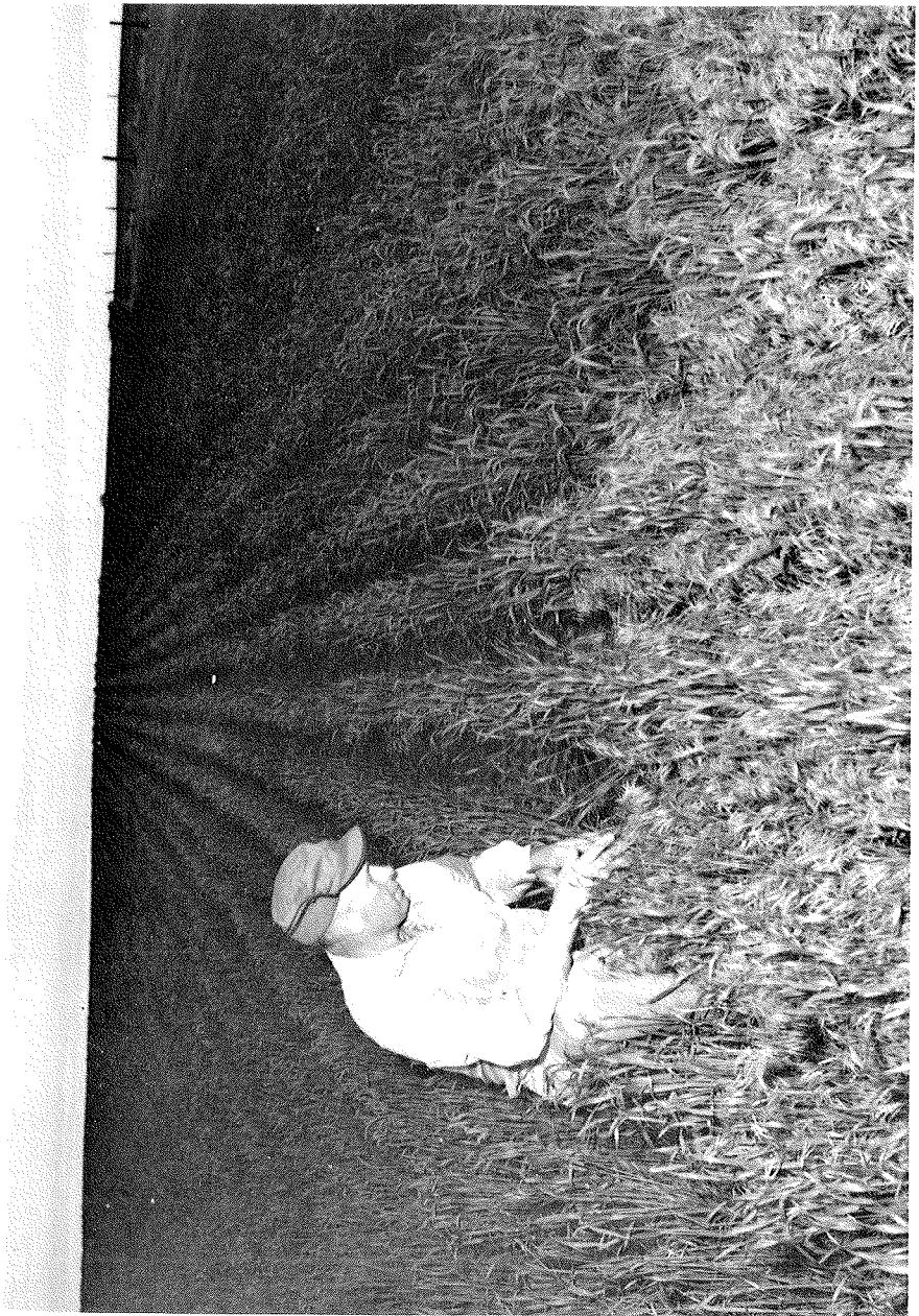
Rotations help control downy brome. Entire area was seeded to downy brome. Winter wheat fallow rotation contained 30,000 plants per acre (foreground). Winter wheat sorghum fallow rotation contained 300 plants per acre, (background).