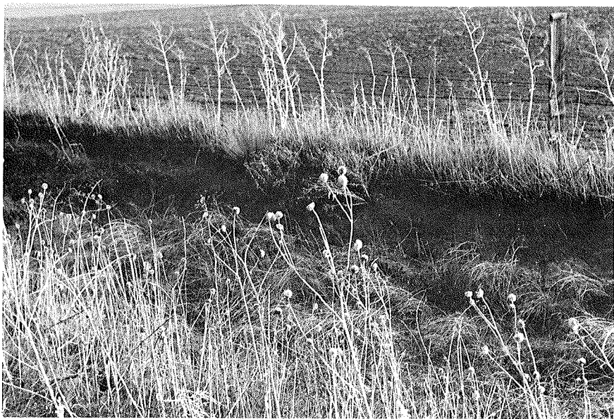
Roadside ditch full of weeds, including downy brome. Provides an excellent source of weed seed for infestation of fields.