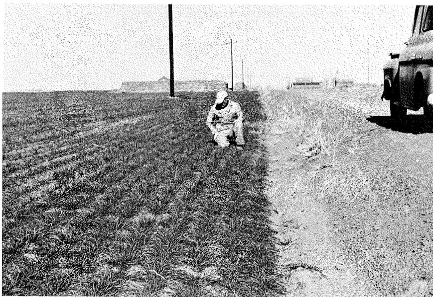
Roadside ditch worked down and cropped.