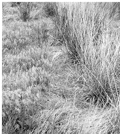
Crested wheatgrass to the right. Note effective control of downy brome in the crested wheatgrass.