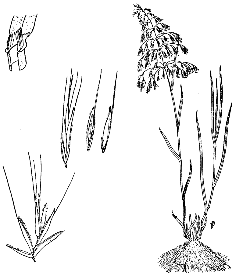
Downy brome. Showing plant and enlarged spikelet, ligule area and seed

Panicle and Seed —Panicles are 2 to 6 inches long, slender and drooping to one side. Spikelets are numerous, 5 to 8, flowered with slender straight awns, 1/2 to 3/4 inch long, each attached to a hairy, buff-brown, narrow seed about 1/2 inch long. Seeds are light and fluffy—about 208,000 per pound. Germination of seed is usually high. However, seed will infest fields for several years because of natural seed dormancy or lack of desirable germinating conditions.