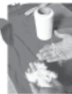
Textile Scientist Yiqi Yang displays a sweater made from cornhusks and dyed Husker red. Above right are cellulose fibers from husks and yarn.

Husks are the strongest part of the corn plant and researchers think their fibers could have other uses such as packing and wrapping materials, fiber composite materials and industrial fabrics.