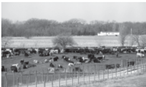
Research by IANR biological systems engineers and animal scientists is yielding information and tools to help minimize livestock odors and predict odor movement.

Researchers also hope to test the model in a Nebraska community within the near future.