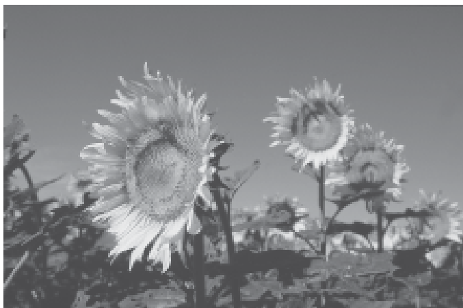
Sunflowers, now a Panhandle mainstay, were once an alternative crop. IANR researchers are exploring other potential new crops for the region.

Bird seed, including proso and foxtail millet, sunflower, sorghum and safflower, is the region's third largest acreage crop behind wheat and corn.