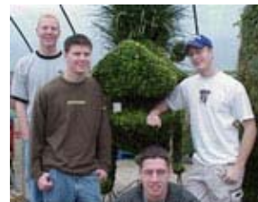
Students venture behind the scenes

Outside the classroom, students get a firsthand look at real-life engineering through industry visits. The Learning Community has gone to Black & Veatch (an engineering and construction consulting company in Kansas City); visited the First National Tower being built by Kiewit Construction in Omaha; and took a three-day excursion to Florida.