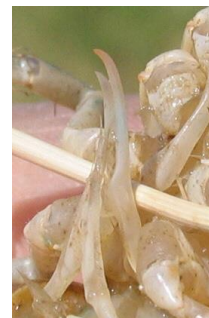
Immature (Form II) pleopod