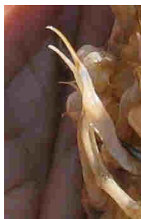
Mature (Form I) pleopod