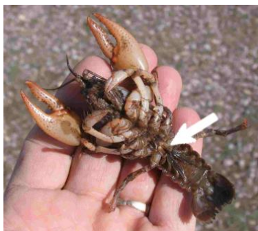
First pleopod tucked up between legs

I will attempt here to provide a photographic guide to field identification, one species per page. Now, by the book, crayfish ID can depend on a variety of characteristics, the most important being the shape of the first pleopod of a mature male. Did I just lose you??? OK. Some basic life history of our crayfishes. Male crayfish change twice a year from a non-breeding immature form to a breeding mature form. This is identified by the shape of the first pleopod. The first pleopod is what the crayfish uses to transfer sperm packets from the male to the female. See photos below. The first pleopod is usually tucked up between the legs. I use something pointy to pry it out. (Note: if the pleopod isn't there, it's a female)