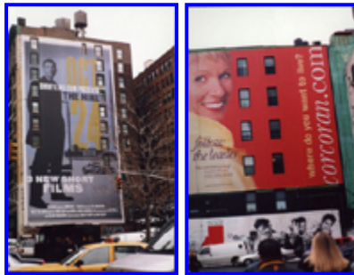
Figures 6 and 7. A new “mesh” is used not only on buildings but also on conventional billboards – large bulletins and smaller posters. Billboards that we see on highways are now typically wooden boards “wrapped in a giant condom.” The mesh material can be printed on, withstand all types of weather, and is easily transportable to allow boards to be rotated to several locations to capture different traffic and more audiences. – Production Specialist

Advertisements for BMWFILMS.COM and The Corcoran Group (Figures 6 and 7) are two examples of this new technique. The viewer can hardly notice the vinyl, and the advertisements appear as if they were the skin of the building—complete with windows. Both images are realistic, probably printed from digital technology, and very large—the standing man dressed in a black suit is eleven stories high, while a woman real estate agent's profile is more than four floors high.