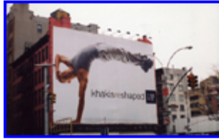
Figure 9. Strategies for creative – “You need to be fun and risky and smart... you can’t ignore the scene, but play into it... Sometimes you have to one-up what’s already out there.” – Creative Director

How is this advertisement different from those with men? For example, the “khakisreshaped” advertisement for Gap shows a giant man (Figure 9). Unlike the woman, he is not posed; but like a Muybridge photo, is suspended in a split second depiction. He is obviously a man caught in action and nothing more, while the lioness woman in the Luis Vuitton visual is specifically posed.