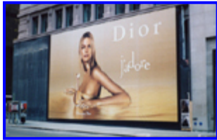
Figure 18. When asked why women should be used in outdoor advertisements, one creative director suggested for a “A quick read,” while an outdoor specialist reflected, “You have to think of society, everyone will go to a good looking woman.”

As women appear more like props than people they can easily become statue-like figures. The visual for Dior J'adore (Figure 18) presents a woman from the chest up, the rest of her body cut off by a sea of gold. Her skin and hair seem to be gold-leafed. Her head, neck, face, and chest elongated while her arm is an enormous triangle that ends in one hand reaching towards a drop-like bottle. Her other hand is a freakishly shriveled claw jutting from her breast. Is she wading chest deep in a placid sea of liquid gold, slowly pushing the bottle ahead of her, or a museum piece—a sculpture of gold?