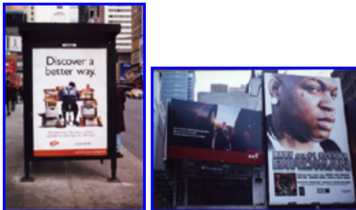
Figures 22 and 23. “[Women] should not be about just cleavage, but images need to resonate with the target audience, the idea needs to be hooked into something more with buzz. [Therefore, ads] could be more intellectual.” – Creative Director

Other stereotypical portrayals are relevant to gender. Men are often depicted in tough guises, boxed into narrow masculine roles that require them to be rough and mean. “Birdman” (also in Figure 23) illustrates this attitude. Our culture doesn’t allow men to be sensitive or to show emotion.