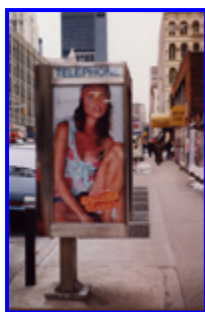
Figure 13. Outdoor has to “...create something that’s visually arresting.” – Creative Director

Visuals are often sexually suggestive in other ways. In Figure 13, the logo could be put anywhere, but it is placed by the woman’s crotch. This is not incidental—it is consciously placed there by an art director who thought—angle in bold, hot colors. Is it an oversight that the colors of the logo are not repeated anywhere else in the composition?