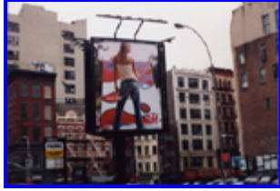
Figure 17. “Most people are just interchangeable.” – Creative Director

Although simplicity is good, when is it too simple? Do people, especially women, become mere props that are interchangeable? Another H&M advertisement shows a woman in a top and jeans with copy that reads “Jeans $39” (Figure 17). She is shown from the back—no face. This woman is not allowed an identity. Perhaps it is not important – a woman can be replaced by any other. It is only about the jeans. Or is it? Does it tell us that women are only about butts, legs, and possibly backs?