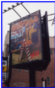
Figure 15. Parameters for outdoor design – “The rule is five to seven words” and “less is more... ten words or less.” – Creative Directors

The apparent formula, less is more, includes figures, often in an environment, with only a logo/brand name completing the dimension. H&M uses a man clad in clothes that are no different than those seen on the streets—tank top and khaki cargo shorts (Figure 15). The apparel is highlighted by a figure with outstretched arms standing on a ladder in front of a freshly painted mural. Through a relatively elaborate composition for a low-end sale, “Tank top $9,” the visual creates a feeling or image, an important part of branding.