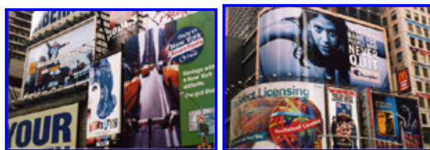
Figures 2a and 2b. “[Outdoor] is everywhere, for everyone to see... everyone sees it, from the cab driver and the truck driver to the guy getting a limo ride... you can’t help but see a good board. It’s everywhere.” – Creative Director

Outdoor is employed for the obvious—it is big (or at least can be), it is everywhere, everyone can see it, and it makes for powerful imagery. Times Square, probably the quintessential example of a barrage of outdoor images, is remarkably close to where the first large outdoor poster was created in 1835 for a circus 5 (OAAA Website, 2003). No matter where you point and shoot, images compete for space (Figures 2a and 2b).