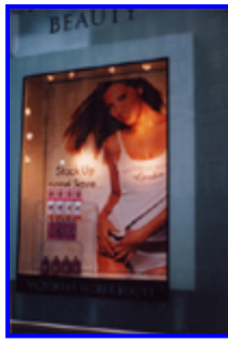
Figure 11. Women are about “culture, along with sex, death, taxes, drinking, and having fun.” – Creative Director

Granted, the last two examples are for undergarment manufacturers and messages may need to be explicit. But not always so. Playtex, also in the business of intimate wear, uses a relatively modest visual (Figure 12). The blond, blue-eyed model looks directly at the camera while her pale skin seems to disappear into the white background—effectively highlighting the black product without implying intimacy.