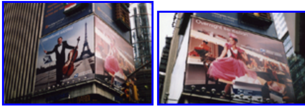
Figures 20 and 21. Women are symbols of “basic human truth, something everyone can relate to, they’re about culture.” – Creative Director

examples of stereotyping have already been noted. Now consider advertisements by the United States Postal Service, a branch of the Federal Government, in Figures 20 and 21. Both genders in the visuals receive mail, in this case to support careers. However, the contents of the packages are quite different—the man gets sheet music, to enhance his intellectual spirit, while the woman gets a princess dress, to enhance her appearance.