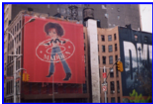
Figure 19. Images of women can “connect with people... broad enough for everyone... for kids, to the truck driver. They convey a message to everybody.” – Creative Director

The Steve Madden image takes the human figure to inhuman proportions by exaggerating body parts (Figure 19). In this simple advertisement, the woman's head is very large, her torso petite, her legs long, and her boots specific. Is this her body? Yikes! Or maybe the camera has played a clever if not mean trick? Or is it all Photoshop? Have they been interchanged? Is it acceptable to cut and paste pieces of people? Or for that matter your own body? Today, pieces are easily bought and changed. Does this mean that society doesn't accept men or women for their natural selves?