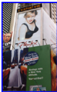
Figure 12. “[Outdoor] can’t be too complicated, visually.” – Creative Director

Granted, the last two examples are for undergarment manufacturers and messages may need to be explicit. But not always so. Playtex, also in the business of intimate wear, uses a relatively modest visual (Figure 12). The blond, blue-eyed model looks directly at the camera while her pale skin seems to disappear into the white background—effectively highlighting the black product without implying intimacy.