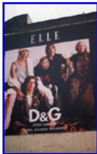
Figure 27. “We’re pretty much in touch... you have to be a cultural junkie. It’s not just media, but it’s radio, it’s art, fashion...” – Advertising Practitioner (Soar, 2000, p. 428).

For the young, hot, and nubile, Tommy Jeans are essential when “hanging” (Figure 28). Nine young men and women do the jungle-all-around thing, dressed in everyday urban, street, jungle fashion—modestly long pants over fashionably exposed undergarments with open shirt and shell medallion necklaces for men, cut-offs and low slung hip-huggers with pronounced bikini tops for women. They are all survivors, just as seen on television. Like a wilderness theme park, a hideaway that is entirely accessible by plane, these folks are expressing their consumer individualities.