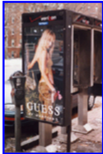
Figure 4. “[Outdoor] is in your face...no matter where you go, you can’t get away from it...It’s there, on taxis, highways, fliers, grocery store floors, coupons, telephones...” – Outdoor Production Specialist

Advertisers can enhance the visual impact by selecting locations depending on the target audience, message, strategy, and creative. For example, Guess by Marciano puts a provocative visual at eye level (Figure 4). The fashion advertisement functions like a mirror for people walking down the street. He or she can stand next to it and project his or her self in the grunge look to try it on—how does it feel, as a friend or as one’s self? It is very common in real estate to say location, location, location — and it is just as relevant for outdoor.