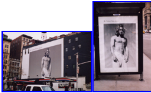
Figures 25 and 26. “[Outdoor] is hot... it’s the last true mass medium.” – Production Specialist

If the male stereotype exists at all, then it is alive and well in Calvin Klein advertisements (Figures 25 and 26). The image—two-thirds surfer hunk, one-third jeans—is all about the idealized, idolized, male upper body. Is this a male beauty desired only for his pecs and pants? Does he have any other attributes? Cryptic thoughts? The pumped-up chest and biceps are seen on billboards around Manhattan and in slightly different configurations at many a local gym—increased frequency builds awareness.