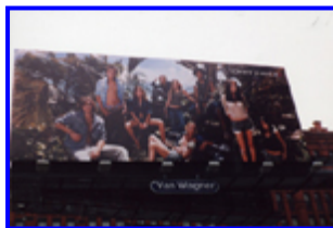
Figure 28. “If I see some technique done in a movie, I will always apply that to an ad.” – Creative Director