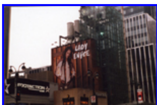
Figure 24. “Women should be used for their beauty.” – Production Specialist

Often in visuals women are seen isolated. The dread-locked woman in the Lady Enyce image (Figure 24) stands alone in front of a wooded wall, jacket held together only by her hands thrust in its pockets, almost like a runaway. The letter style is desperately unspecific.