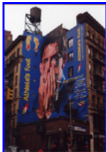
Figure 5. One reason for employing outdoor – “You can’t get much bigger.” – Creative Director

Outdoor’s sheer physical size makes it powerful. Traditionally, outdoor advertisements were painted on sides of buildings in the city, or on barns in the country. While still large, today’s outdoor advertisements are not as easily defined.