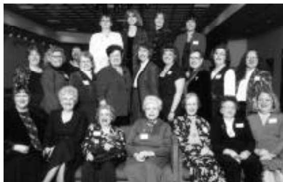
Past Presidents attending the 40th Anniversary Celebration.