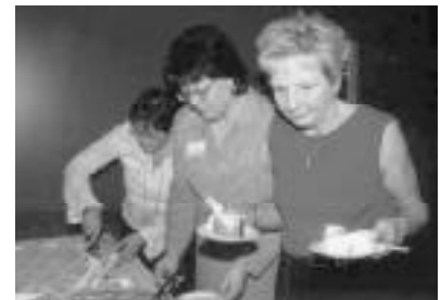
Members of the anniversary committee cut and served cake during the celebration.

UNOPA was organized in January 1963 for the opportunity of all persons engaged in secretarial, clerical, managerial or business work in the educational system of the University of Nebraska–Lincoln