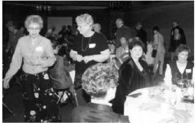
The 40th Anniversary Celebration attracted over 90 current and former members and their guests in February at the East Union.