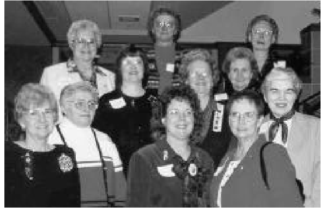
Some of the past-presidents attending the Annual Past-president and Retiree Recognition and Awards Luncheon in April.

I also sent notices or press releases to the Scarlet and E-news about our regular meetings and special events like our 40 th Anniversary Celebration, Bosses Luncheon and Awards Luncheon.