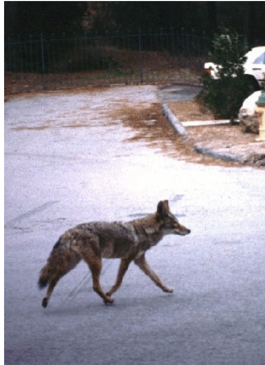
Figure 4. A coyote with little fear of humans is easily seen during daylight hours on an urban street in San Bernardino County, California.

daylight between 9:00 a.m. and 4:00 p.m. Most of the attacks have occurred within a few blocks of the urban fringe area where native brush is abundant or where open space, mandated to mitigate the negative affects of development, has provided brushy wildlife habitat islands surrounded by homes.