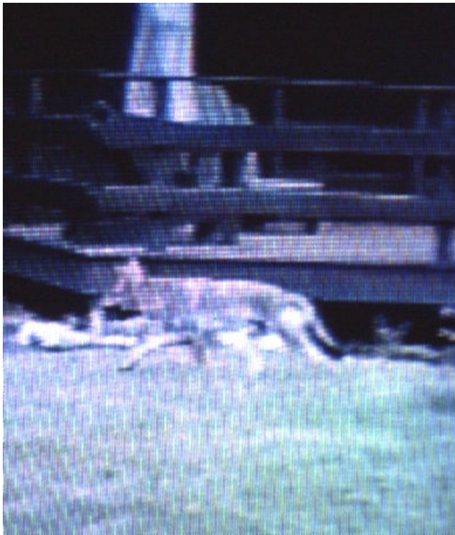
Figure 3. A coyote continued to visit the backyard of a San Clemente residence on a daily basis after it had stalked a 2-year-old child.