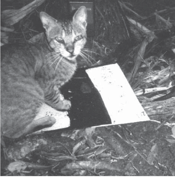
Plate 1 Application of a tracking plate to monitor invasive mammal species in the Caribbean National Forest, Puerto Rico.

per number of traps available, corrected for sprung traps. Rats were euthanized by cervical dislocation.