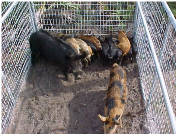
Feral swine.

In late August, 2005 the farmer saw and shot another feral boar. Again, all tests were negative.