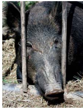
Feral swine.

much time wallowing in ponds, ditches, streams, and ephemeral water sources.