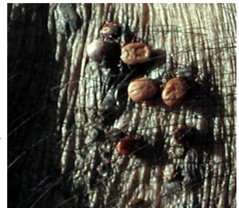
Ticks from feral swine.

disease can be transmitted through tick bites, handling crushed ticks or contacting tick feces on animal fur. It is important to wash hands thoroughly after handling ticks or tick infested animals. RMSF symptoms include "flu-like" symptoms of fever, muscle aches and chills, and a characteristic red rash appears on wrists and ankles within several days.