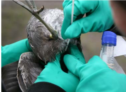
Wildlife Services personnel sampling for avian influenza in wild birds.

ever, there are no documented cases of the disease ever being transmitted to humans from wild birds. Wild, migrating birds may be one possible route of entry for HPAI into North America. If the disease is spread by wild birds, the first