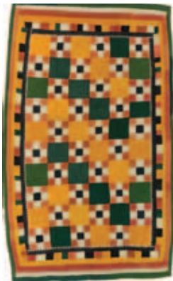
Quilts Ralli, Sindh, Pakistan, c 1974 (far right) Kantha, c 1940-1960, (right)