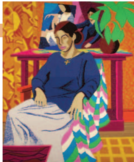
The Sitting, Don Burns wool & silk weft, cotton warp, 37" x 30"

With 64 works from the USA and ten other countries, the American Tapestry Alliance's 8th Biennial brings the best of international contemporary handwoven tapestry to Lincoln for its debut exhibition. This exhibition will travel to the American Textile History Museum in Lowell, MA, spring, 2011.