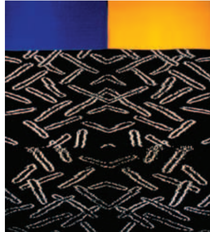
Ancient Text: Indigo and Ochre Mary Zicafoose 2007, weft-face Ikat Tapestry Diptych 58" x 62"