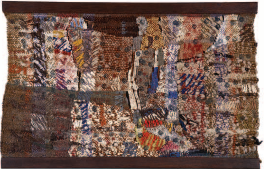
Lillian Elliott, Color it Twill, Tapestry, 20" x 32", 1973 on view at the Tugboat Gallery