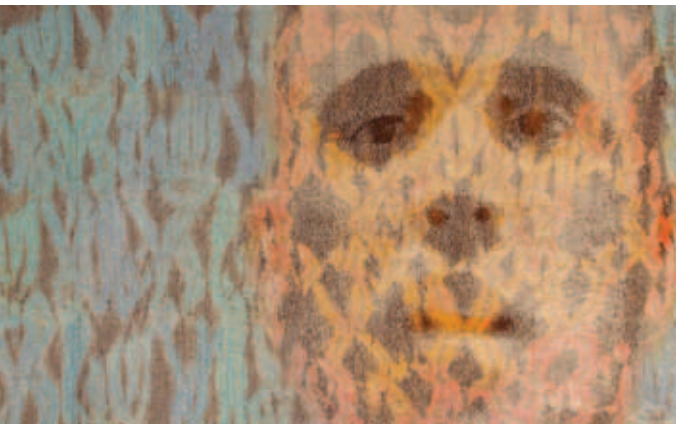
Looking At, Vita Plume