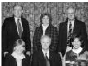
Boss of the Year nominees