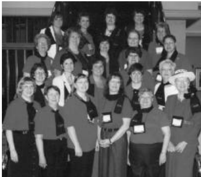
The Nebraska delegation attending the NAEOP Conference in Boise, Idaho. Can you pick out our UNOPA members?

As you recall, in February, we changed Standing Rule 7 to allow UNOPA to give financial support to both the delegate to the Advisory Council and the president-elect.