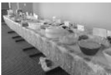
Some of the many salads offered at the Summer Social!

After viewing the exhibits and socializing, the ladies went to the Schoor Presidential Suite on 6 th floor to enjoy a salad dinner. Each person attending was asked to bring their favorite salad and some copies of the recipe to share. Salads were arranged on long tables with their recipes.