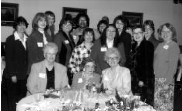
Past Presidents attending the annual luncheon in their honor.

Notices were sent to the E-News and Scarlet for meeting announcements. When submitting to the Scarlet to have it included in the calendar portion of it you need to make an additional comment to please include that. Notices of the new officers are being submitted to the Scarlet and the Neighborhood Extra.