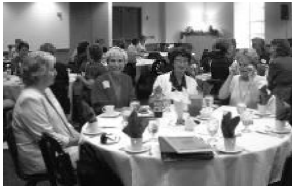
UNOPA members enjoying the September General Meeting.

This committee handles appeals that concern faculty and staff as well as the non-university community. There is another appeals committee dealing with student appeals. We hear approximately five to thirty appeals each month with an average of one to three people showing up in person to state their case. If they do not appear in person we read their written appeal and make a decision based on the facts at hand. Meetings last about one and a half hours.