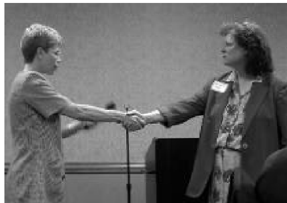
November workshop leaders demonstrating a point.