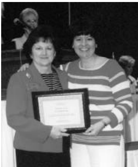
The first ever Past President's Web Page Award was awarded to UNOPA!