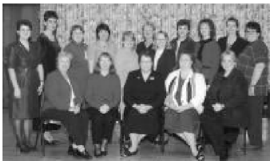
2003-04 UNOPA Board

I was pleased to be invited to a Graduate Studies luncheon, where they implemented a new award for office staff. I followed up with a personal letter to each recipient, and an invitation to join UNOPA. I also spoke a few words at the luncheon on behalf of UNOPA.