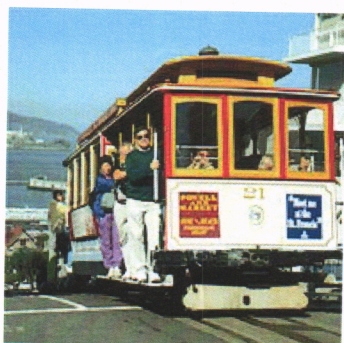
San Francisco CVB

This track will focus on everything green. What are organizations doing to conserve power use not only in the data center, but campus wide? Organizations are implementing telecommuting policies, data center policies, technologies that conserve power, and more in order to "go green."