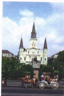
NOCVB, Carl Purcell

With all of the changes that occur to an organization's infrastructure each day, how well are you managing? What tools are you using to record these changes or to facilitate the discussion? This track will focus on what some organizations are doing to track changes to the infrastructure and what tools are available to assist organizations.