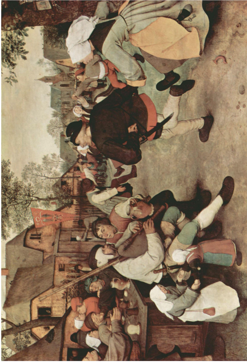
Figure 1. Pieter Bruegel, Peasant Kermis , oil painting, c. 1567–68, Kunsthistorisches Museum, Vienna.