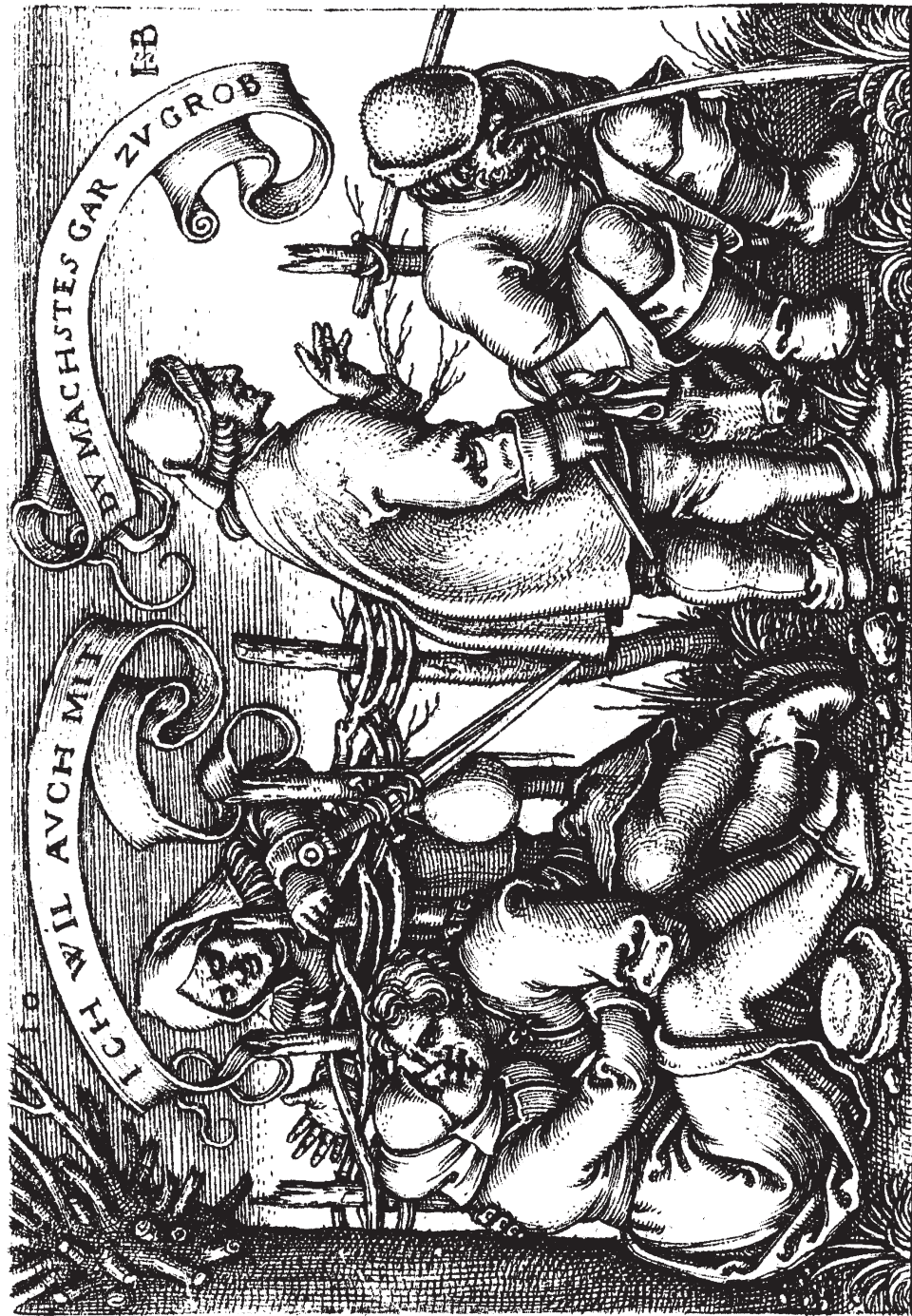
Figure 3. Sebald Beham, Peasants Behind a Fence , engraving, 1547, no. 10 in the series Peasant Festival – Twelve Months , British Museum, London (courtesy Photographic Collection, Warburg Institute, University of London).