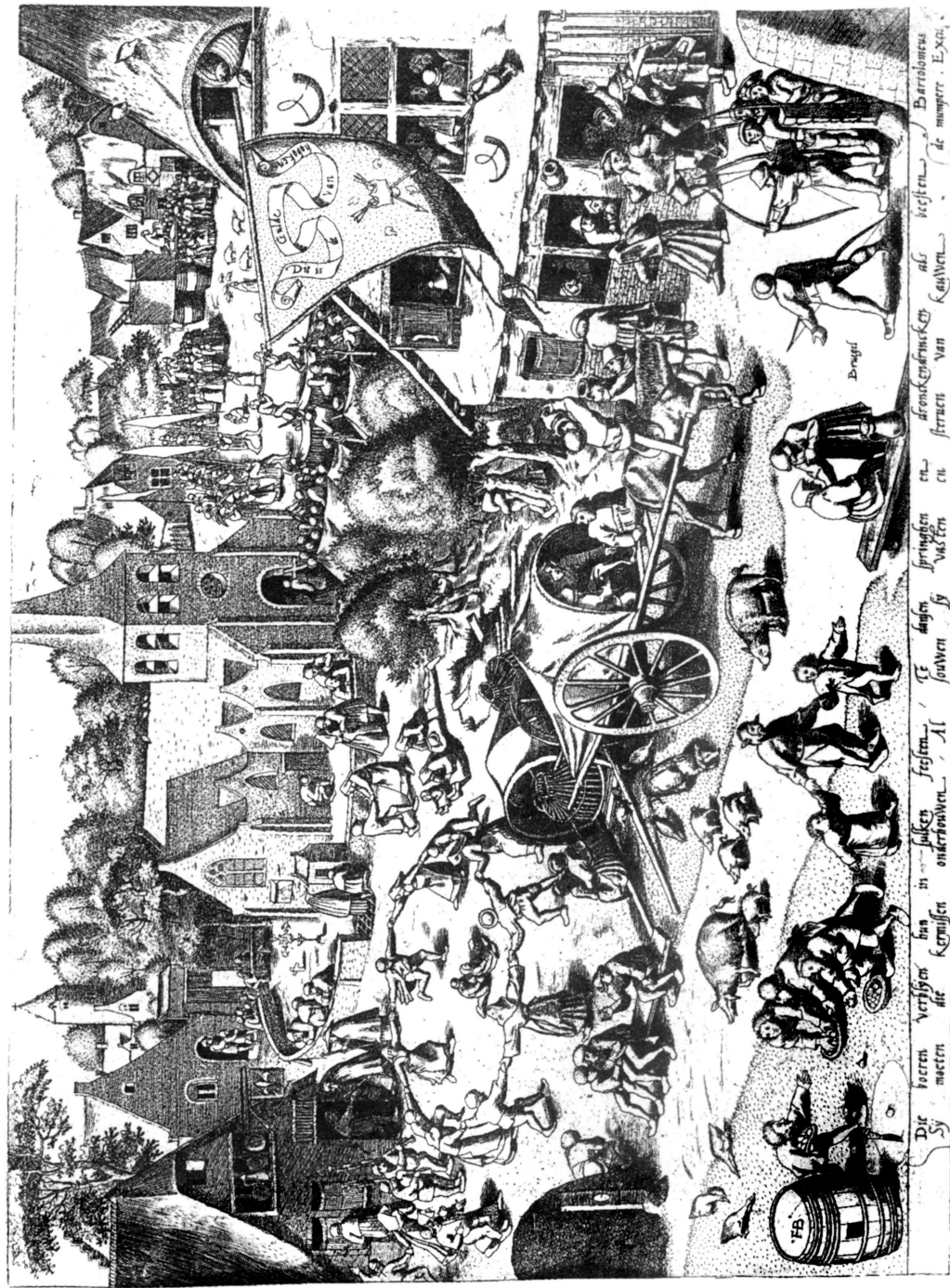
Figure 5. Pieter Bruegel and Bartholomeus de Momper (publisher), Kermis at Hoboken , etching and engraving c. 1559, Rosenwald Collection, Photograph © 2002 Board of Trustees, National Gallery of Art, Washington.