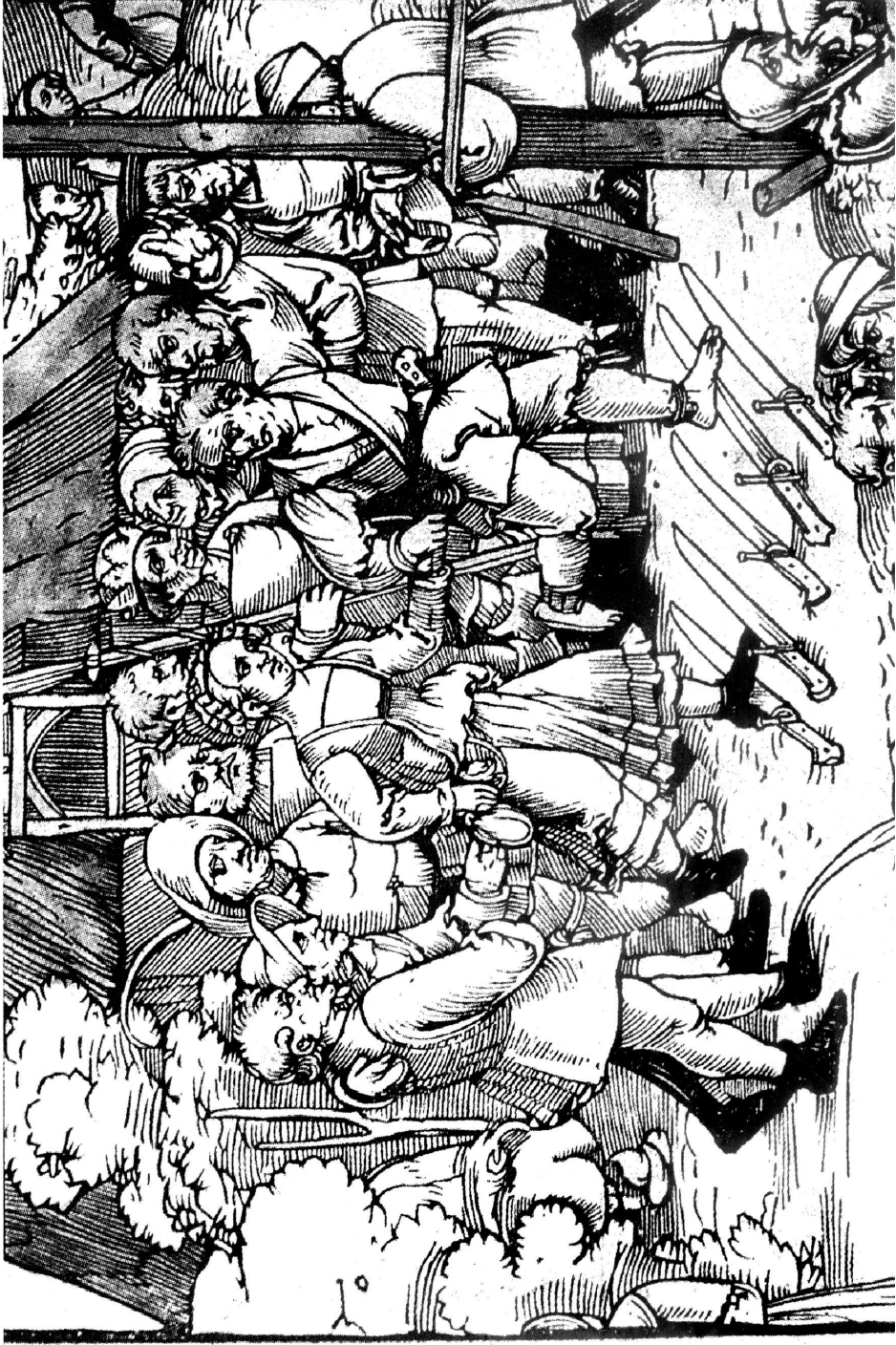
Figure 2. After Sebald Beham, Kermis Oxford, detail, Woodcut, after c. 1535, Ashmolean Museum, Oxford.