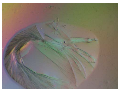
© 2005 International Union of Crystallography All rights reserved

As an alternative or complementary approach to hookworm control, an international effort has been initiated to develop an anti-hookworm vaccine aimed at reducing worm burdens and intensity (Hotez et al. , 2003). The selection of antigens for hookworm vaccine development is based partly on the early observation that the infective stages of the parasite, the third-stage larvae (L3), are immunogenic (Miller, 1971) and that radiation-attenuated living L3 have been successfully used as a veterinary vaccine for canine hookworm infection in the late 1970s (Miller, 1978). A major goal of vaccine development for humans is to reproduce the effect of live attenuated L3 vaccines by substituting with L3-derived antigens in recombinant form (Hotez et al. , 2003). It was subsequently determined that there are two major antigens secreted by L3 upon host entry: ancylostoma-secreted protein-1 (ASP-1) and ASP-2. ASPs are nematode-specific proteins that belong to the pathogenesis-related (PR) protein superfamily. PR proteins were initially isolated from