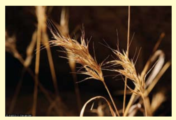
Red brome, a cousin of cheatgrass, is invading the shrublands of the Mojave Desert.

Grasses respond rapidly to yearly fluctuations in rainfall, Brooks says. A wet growing season produces more grassy biomass than a dry one, and thus, in a grass-dominated landscape, there is a tie between higher than normal rainfall in one season and the occurrence of fires in the next.