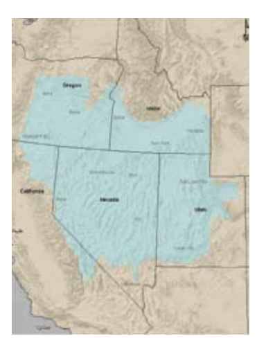
The Great Basin takes in parts of five states.

The Great Basin is a large arid and semiarid area between the Rocky Mountains and the Sierra Nevada-Cascade range. It covers nearly 211,000 square miles, an area almost four-fifths the size of Texas. It takes in most of Nevada. about half of Utah and Idaho, the southeastern quarter of Oregon, and the sliver of California lying east of the Sierra Nevada.