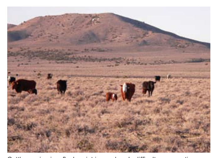
Cattle grazing is a flash point in an already difficult conversation among Great Basin citizens and land managers.

However, recent research led by Jeanne Chambers demonstrates that using grazing to reduce fuels may have significant unintended consequences. Her results indicate that when grazing reduces the abundance of