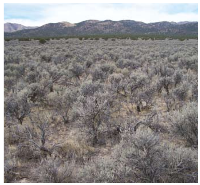
More than 20 species and varieties of sagebrush dominate the Great Basin's sagebrush steppe lands.

across the rugged landscape. Plant communities are keyed to elevation, although there is much intermixing of communities at the edges. The highest slopes and ridges feature alpine meadows and forests dominated by pines. Intermixed with these forests in moister environments are groves of aspen, one of the few broad-leaved trees to be found in the West's intermountain forests. Slightly lower down are mountain big sagebrush communities and associated pinyon pine and juniper woodlands.