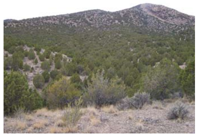
Encroaching juniper is shifting the fire regimes in higher-elevation steppe lands.

For example, in mid-elevation (4,600–5,400 feet) sage-steppe lands in Modoc County, California, juniper encroachment and an increase in fuel loads is shifting the fire regime from low-intensity fires that occur every 30 to 70 years to less-frequent, higher-