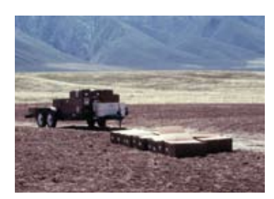
Researchers at the Great Basin Native Plant Selection and Increase Project raise native forbs and grasses in planting boxes (top). At bottom, seed production of Phlox longifolis .

These two projects—SageSTEP and the Great Basin Native Plant Selection and Increase Project—