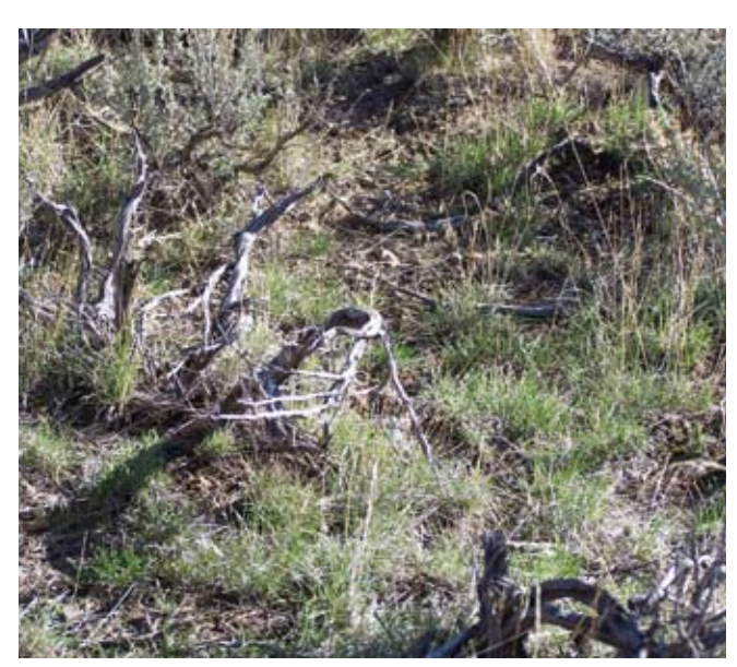
The understory of intact sagebrush steppe contains native bunchgrasses, forbs, and sometimes a crust of lichens on the soil.

Before European-American pioneers arrived in the 1800s, the sagebrush-steppe vegetation communities had adapted to their challenging and changing climate over thousands of years. The deep-rooted sagebrush and other shrubs pull water from varying depths in the soil, and they anchor the soil and inhibit erosion. The tough bunchgrasses can withstand extended drought as well.