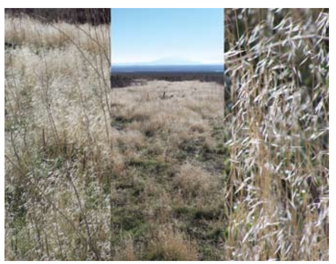
Cheatgrass is the poster villain of invasive species in the Great Basin

one-quarter of it. Introduced from Eurasia more than a century ago, probably in the course of European immigration, cheatgrass quickly grabbed hold in the Great Basin, settling mostly in the low and mid-