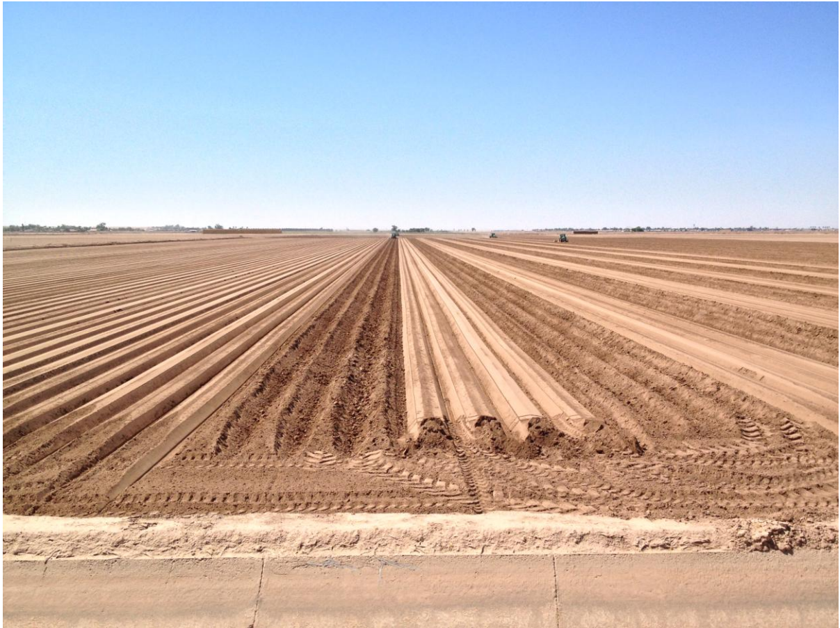
Figure 1.4 - Beds being listed and shaped after soil has reached desired consistency from tillage.