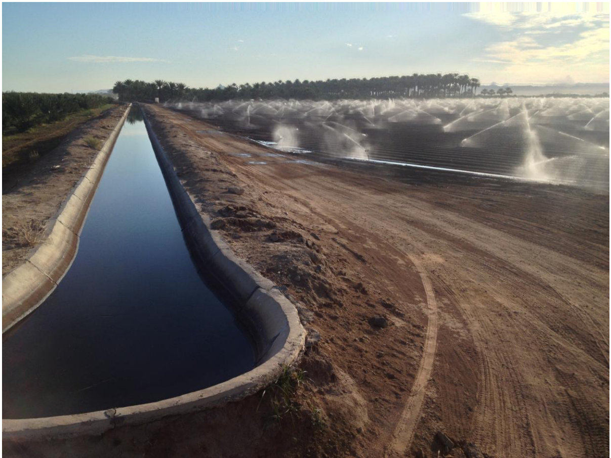
Figure 1.5 - Sprinkler irrigation system used after planting to help promote germination and stand establishment.