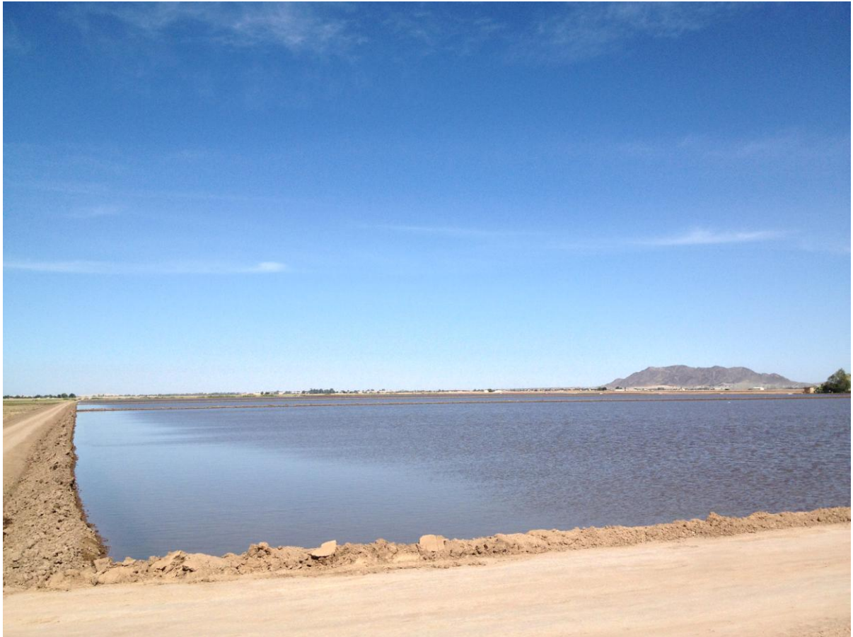
Figure 1.3 - Individual field flooded after leveling to facilitate salt leaching and volunteer or weed seed germination.