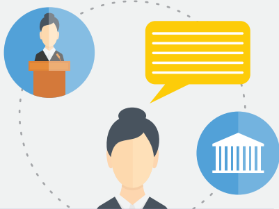
JUSTICE RUTH BADER GINSBURG

Some people think fair use is a minor exception or a marginal carve-out from the expansive protection for authors, but fair use is a fundamental right .