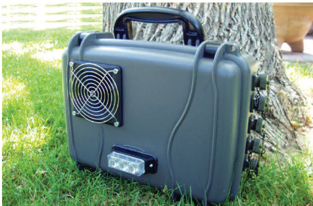
Figure 3. The ScareCall, a fully programmable light and sound device that can be suspended on a fence or tree in a pasture to prevent the advance and intrusion of wary carnivores. The device can use randomly activating lights and repellent sound effects (e.g., gunfire), or can be programmed with attractant calls (e.g., prey distress calls) to draw predators into an area for capture.

Many aspects of electronic disruptive-stimulus devices require more thorough research. The optimum area and duration of effective protection are not known, although a working hypothesis is 10 hectares and 2–3 months per device. The relative (and potentially synergistic) effects of auditory and visual stimuli have not been adequately examined, nor has the effectiveness of incorporating other sensory modalities, such as olfactory stimuli. For simple stimuli, even wary animals such as wolves will eventually habituate completely and even approach the devices (Fritts 1982). Methods of decreasing habituation, such as behavior-contingent activation