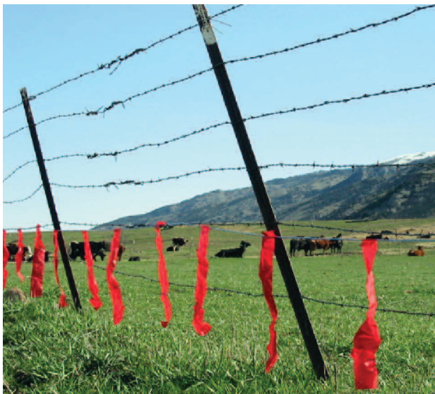
Figure 1. Fladry, a line of flags hung on the outside of a pasture to dissuade wolves from crossing it and entering the area.

Fladry (figure 1) is a tool of ancient derivation for deterring wolves (Fritts 1982, Musiani and Visalberghi 2001) that has recently become commercially available and available by the kilometer (Carol's Creations, Arco, Idaho). Fladry is installed by hanging lines of flags around fields to prevent intrusion; it has some effect of dissuading wolves from entering areas (Musiani et al. 2003), although other predators are not susceptible to it. Its effectiveness on less wary species (e.g., ursid or avian predators) is limited (Shivik et al. 2003a), but