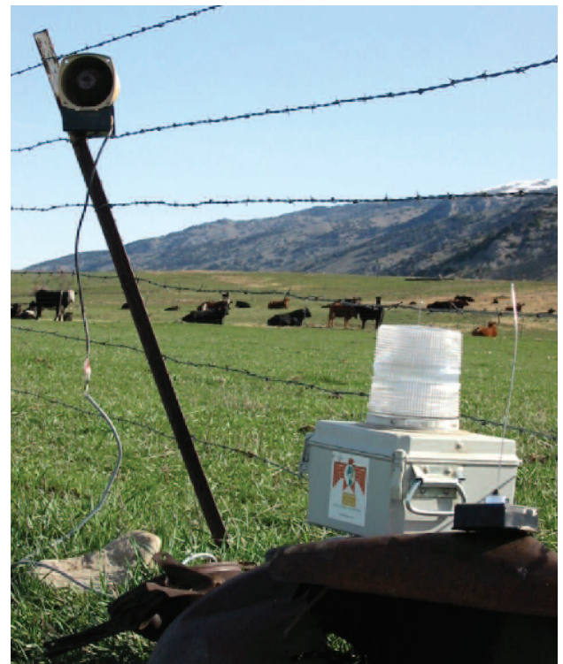
Figure 4. The radio-activated guard (Avian Systems Model 9000 frightening device). When a radio-collared predator approaches the area, the strobe light activates, along with a series of 30 sound effects.

An old technology of special note due to its recent popularity is the use of guard dogs. Guard dogs were investigated in the late 1970s and 1980s in the United States (Linhart et al. 1979, Green et al. 1984) and have been largely incorporated into western US sheep production operations; indeed, by 1993, 65 percent of the sheep producers in Colorado were using guard dogs (Andelt 1999, Andelt and Hopper 2000). Dogs are thought to be effective against wolves in parts of Europe (Rigg 2001, Fritts et al. 2003). In the United States, however, complications arise when wolves sometimes befriend, or more often kill, guard dogs (Bangs et al. 2005). Indeed, throughout the world, wolves also kill dogs wherever the two canids occur, even to the point of dogs' being an important food supply for some wolves (Fritts et al. 2003). Thus, guard dogs are a useful tool, but not a panacea. Volumes have been written about the use of guard dogs worldwide (Rigg 2001), and in that sense, there is little new in their use. In a theoretical context, however, dogs and other guard animals (Green 1989, Meadows and Knowlton 2000) can be thought of as behavior-contingent, multisensory disruptive stimulus producers, and continued understanding of their training and use may result in what amounts to the ultimate disruptive stimulus device.