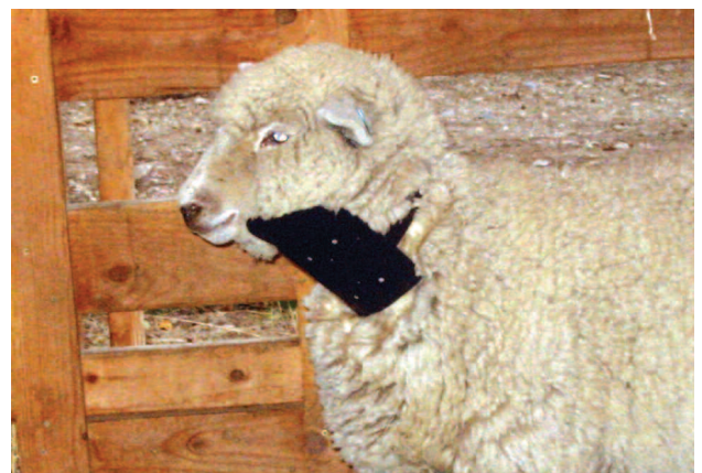
Figure 2. The King Collar, a simple plastic collar designed to be worn by vulnerable livestock. Its intent is to provide armor-like protection to the throat of animals, the area where jackals and coyotes typically target their attacks.

Methods of delaying habituation, such as behavior-contingent activation (Shivik and Martin 2001), are important for increasing the longevity of effectiveness of disruptive stimuli, and modern sensors have been incorporated into some tools. The Model 9000 frightening device (Avian Systems, Louisville, Kentucky), commonly known as the radio-activated guard (RAG; figure 4), employs a scanning radio receiver to monitor the proximity of radio-collared animals (Breck et al. 2003). If a radio-marked predator approaches a protected area, such as a calving pasture, the unit activates a strobe light and a series of sound effects to prevent the predator from advancing. The RAG is complicated because