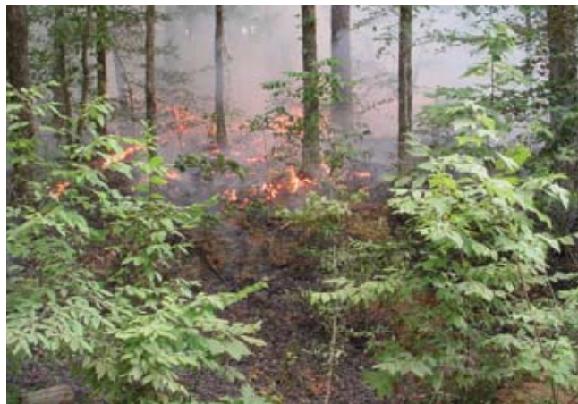
A mixed hardwood forest burns in a WFU fire on Sulphur Mountain, Arkansas.

One of the biggest public concerns about WFU is smoke. When a fire is suppressed, the smoke dies with it, but when it lingers on as a WFU fire, people