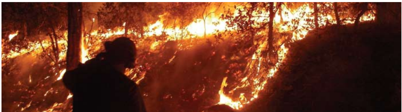
The Warm Fire, Kaibab National Forest, Arizona, 2006.

It may feel safer to put the fire out now. But that just means someone else will inherit the problem down the road.