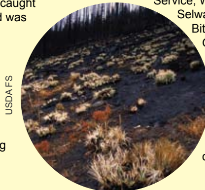
Grasses recolonize a burned slope in the Bob Marshall Wilderness.

Service, WFU programs began in the Selway-Bitterroot Wilderness on the Bitterroot National Forest and the Gila Wilderness in New Mexico. These programs, then known as “prescribed natural fire,” were very successful, and in 1978 the Forest Service mitigated its full-suppression policy to accommodate a new one encouraging wildland fire use, carefully prescribed.