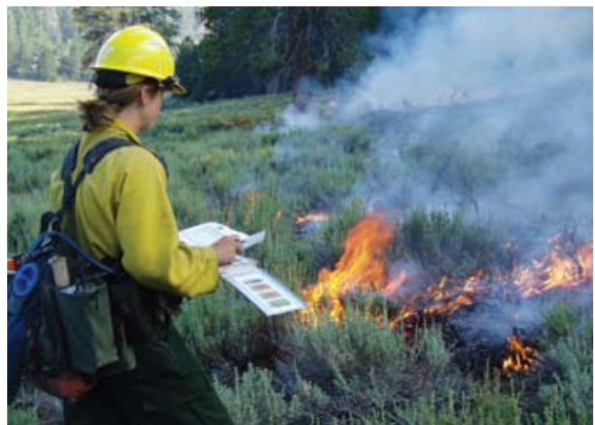
Another WFU fire in the Sequoia National Forest, the Broder-Beck fire.