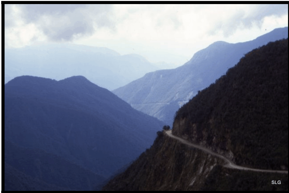
Figure 1. The most dangerous road known to humans (from La Paz to Coroico, Bolivia). This is a two way road, but many times the road is not wide enough for two trucks to pass so one ends up backing up to a turn out, shown here. This is typical Yungas habitat in the Departamento de La Paz, Bolivia.