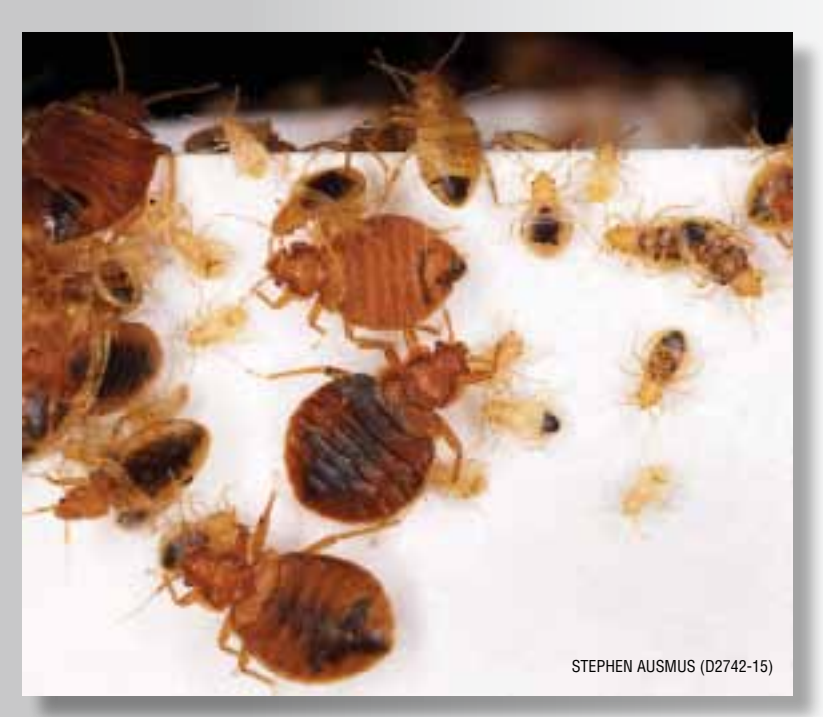
Above: Immature bed bugs molt and shed their skins only after blood feeding. ARS entomologist Mark Feldlaufer collects blood-fed, immature bed bugs that he will isolate in vials to collect individual shed skins for chemical analysis.