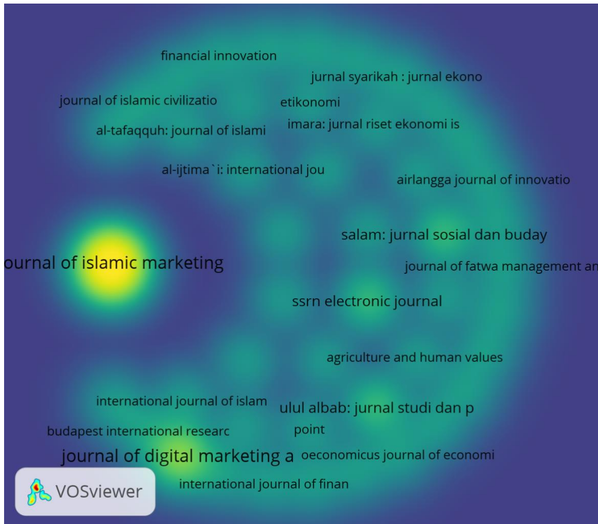
Figure 3: Bibliometric Journal Mapping

Furthermore, the journal mapping visualization is depicted in bibliometric Figure 3 above. Based on the following picture, the journal clusters that appear to be listed in a glowing circle show how productive the journal is in contributing to publishing its paper on the theme of the Halal economy. The largest number of journals is calculated from the number of publications and the number of links to other journals, where a paper writer can write many papers in different journals.