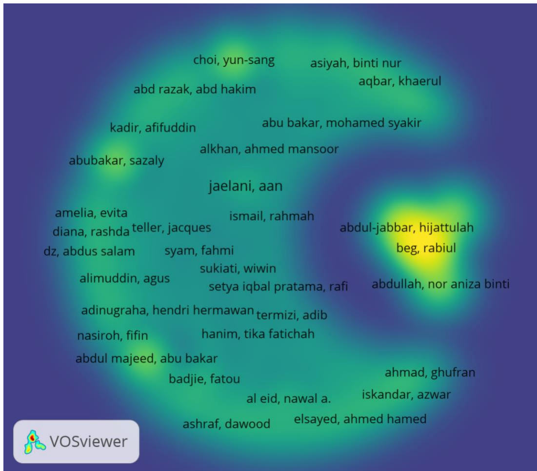
Figure 2: Bibliometric Author Mapping

Furthermore, using the VOSViewer software, we found the authors' bibliometric mapping in Figure 2 above. The bigger the circle of the author's name, the more papers he has published in the paper on the theme of the Halal economy in the last year.