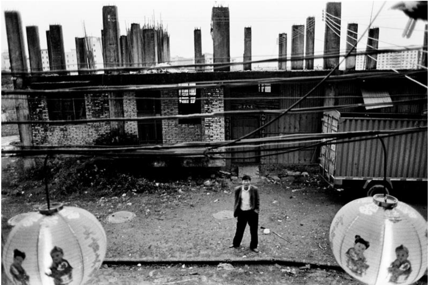
Abandoned construction, 2010