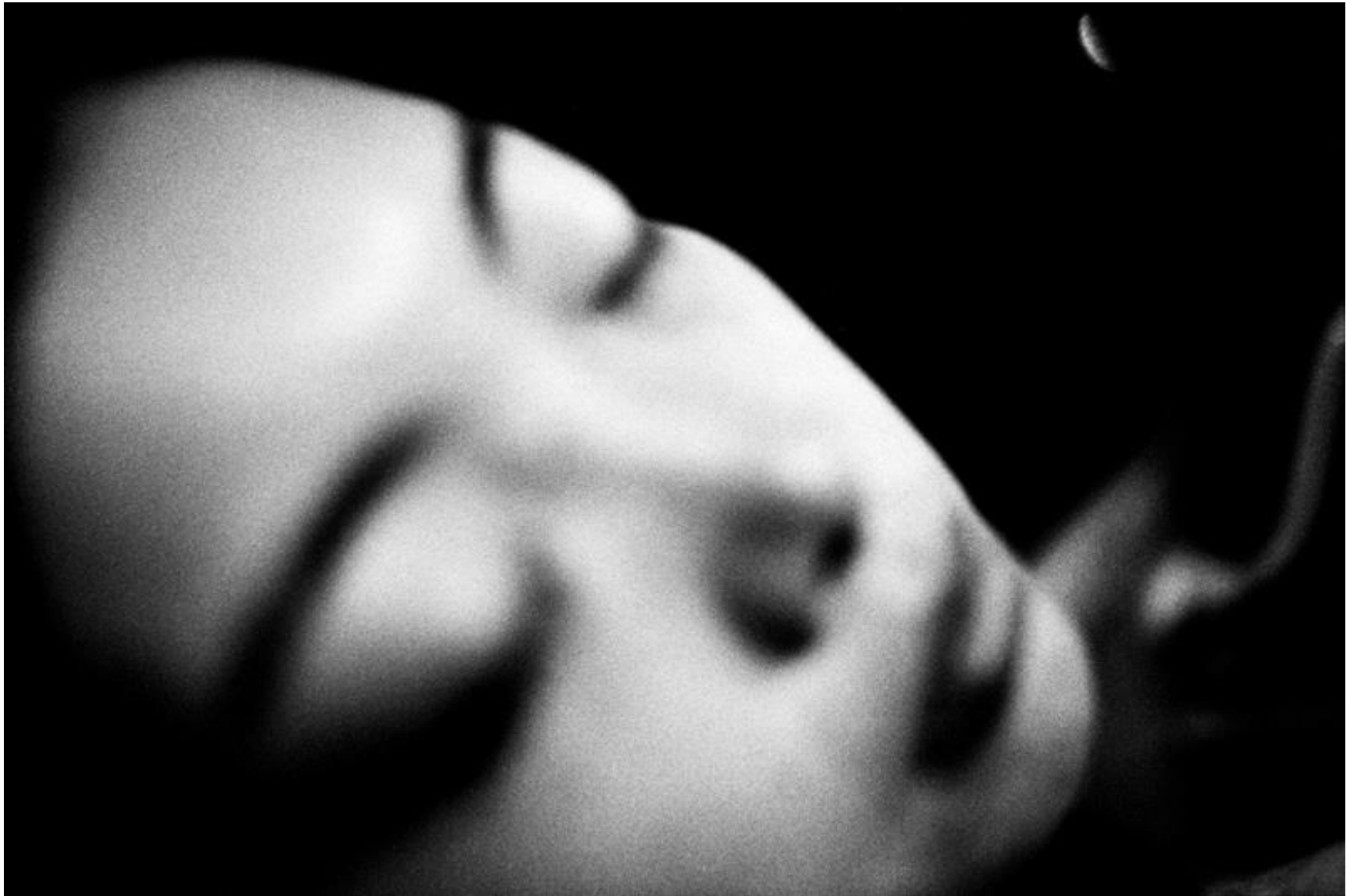
Sleeping on the bus, 2011