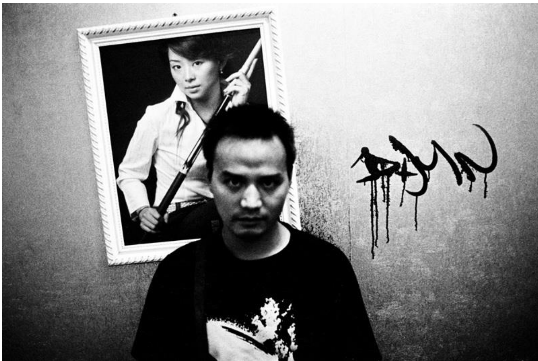
Pool hall, 2011