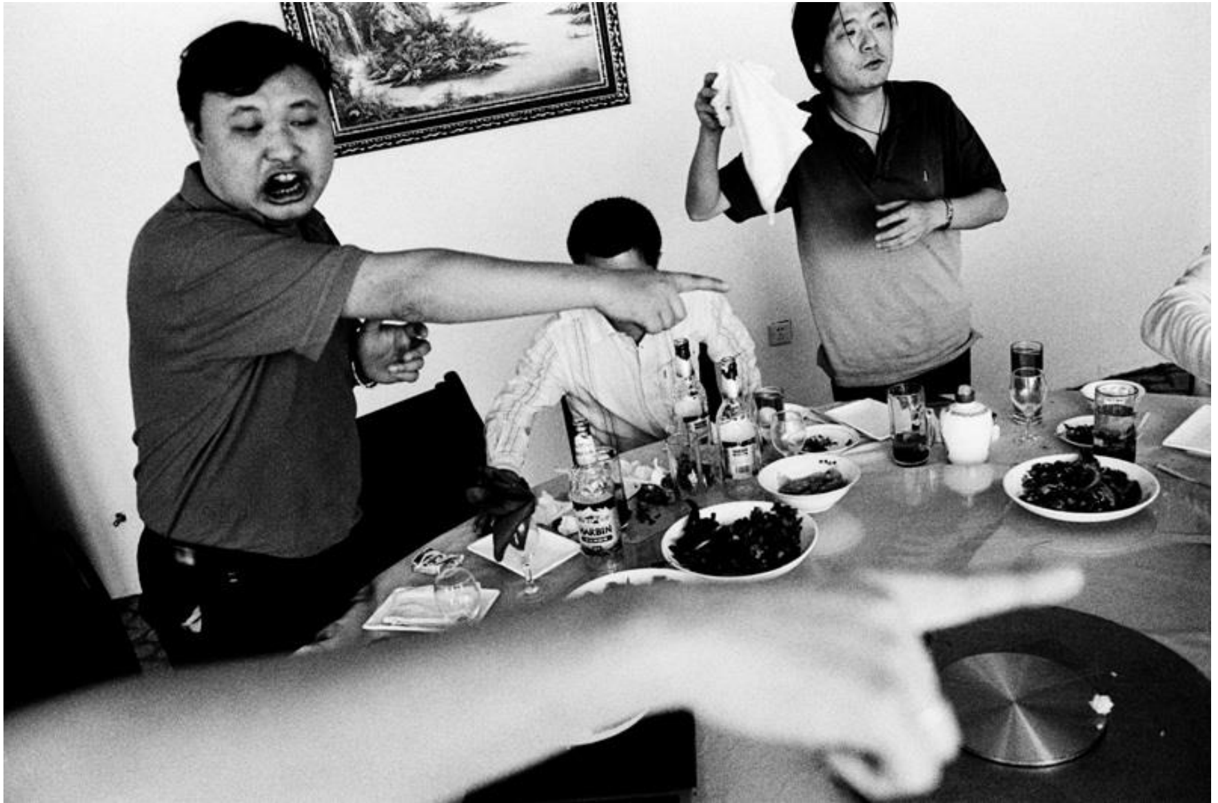
Old friends at lunch, 2008