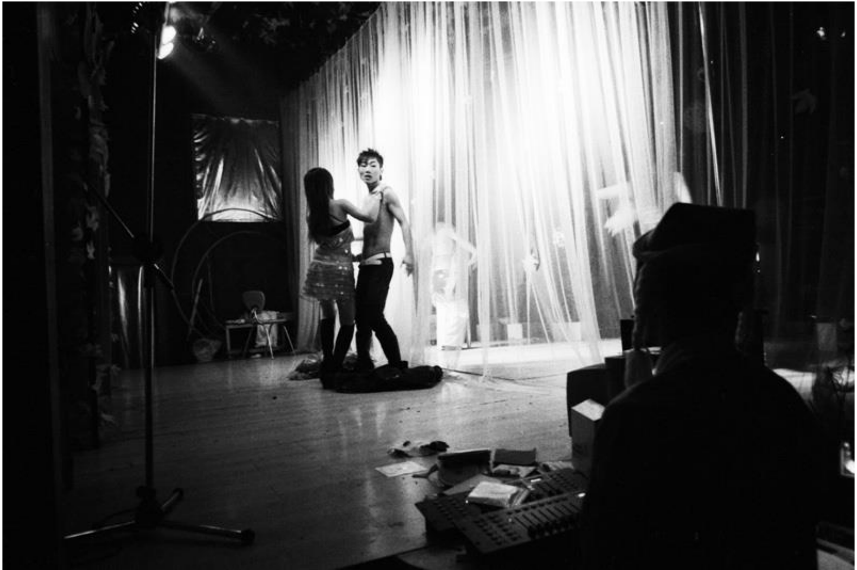
Backstage at the Night Cat gay bar and cabaret, 2007