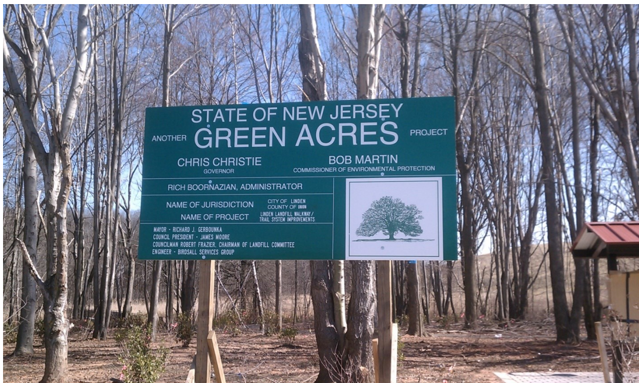
Figure 7: Hawk Rise Project-Linden Landfill