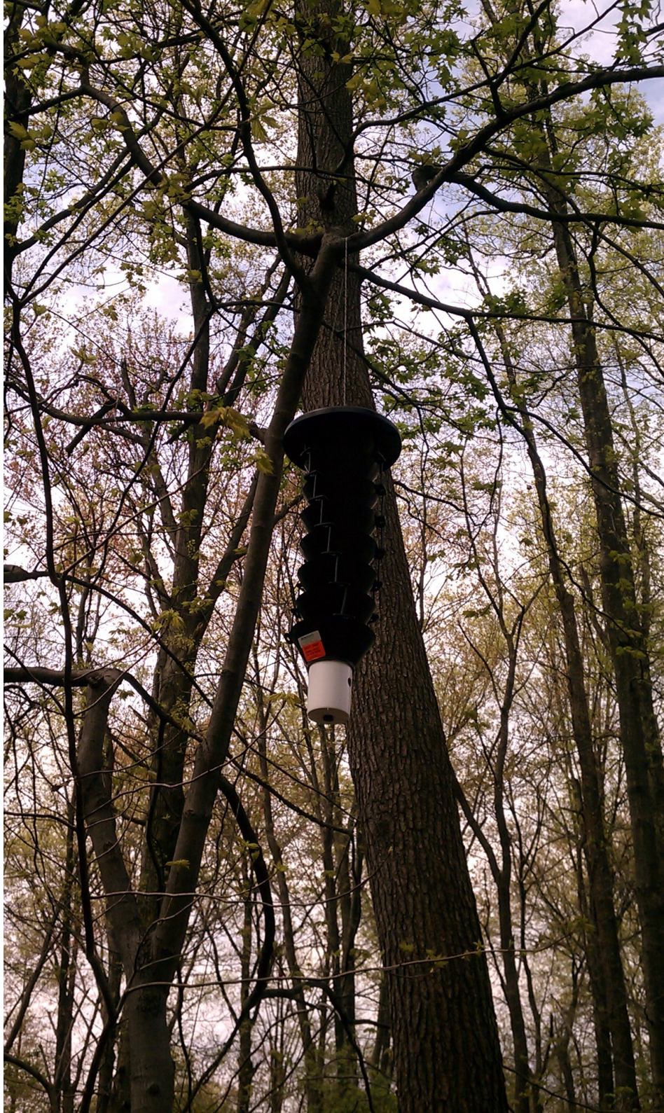
Figure 5: Trap 5 UHR-ethanol