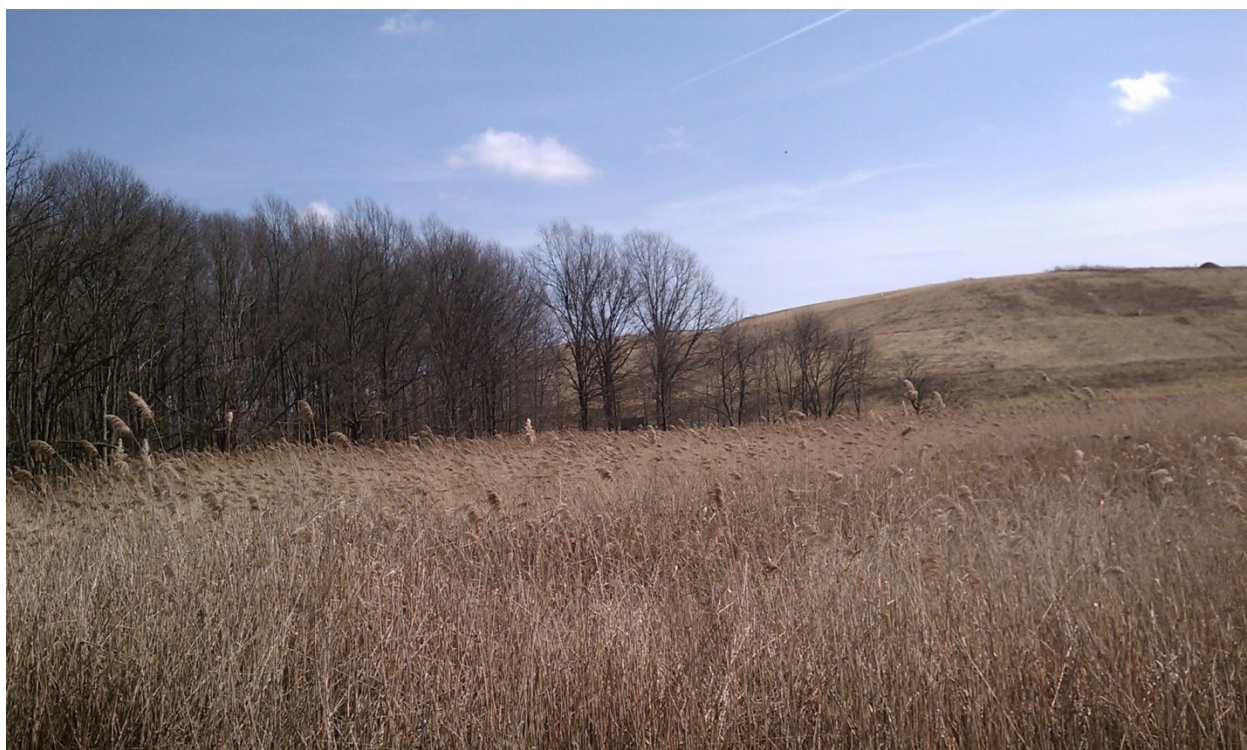
Figure 8: Linden Landfill- Landfill with surrounding forest