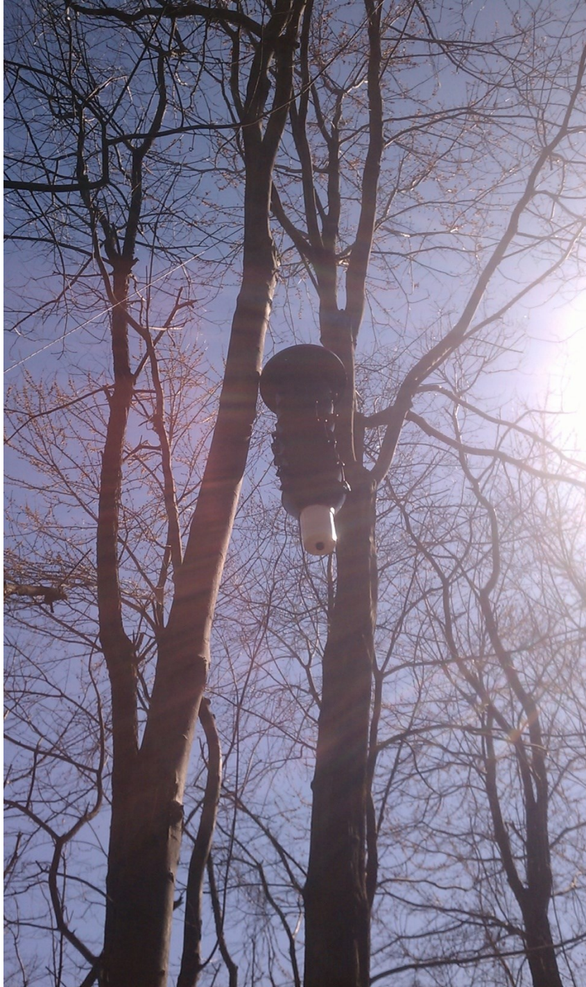
Figure 2: Trap 2 UHR-ethanol