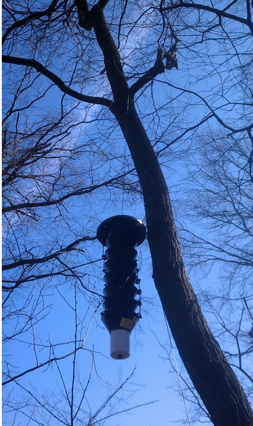
Figure 3: Trap 3 Fermented Bait