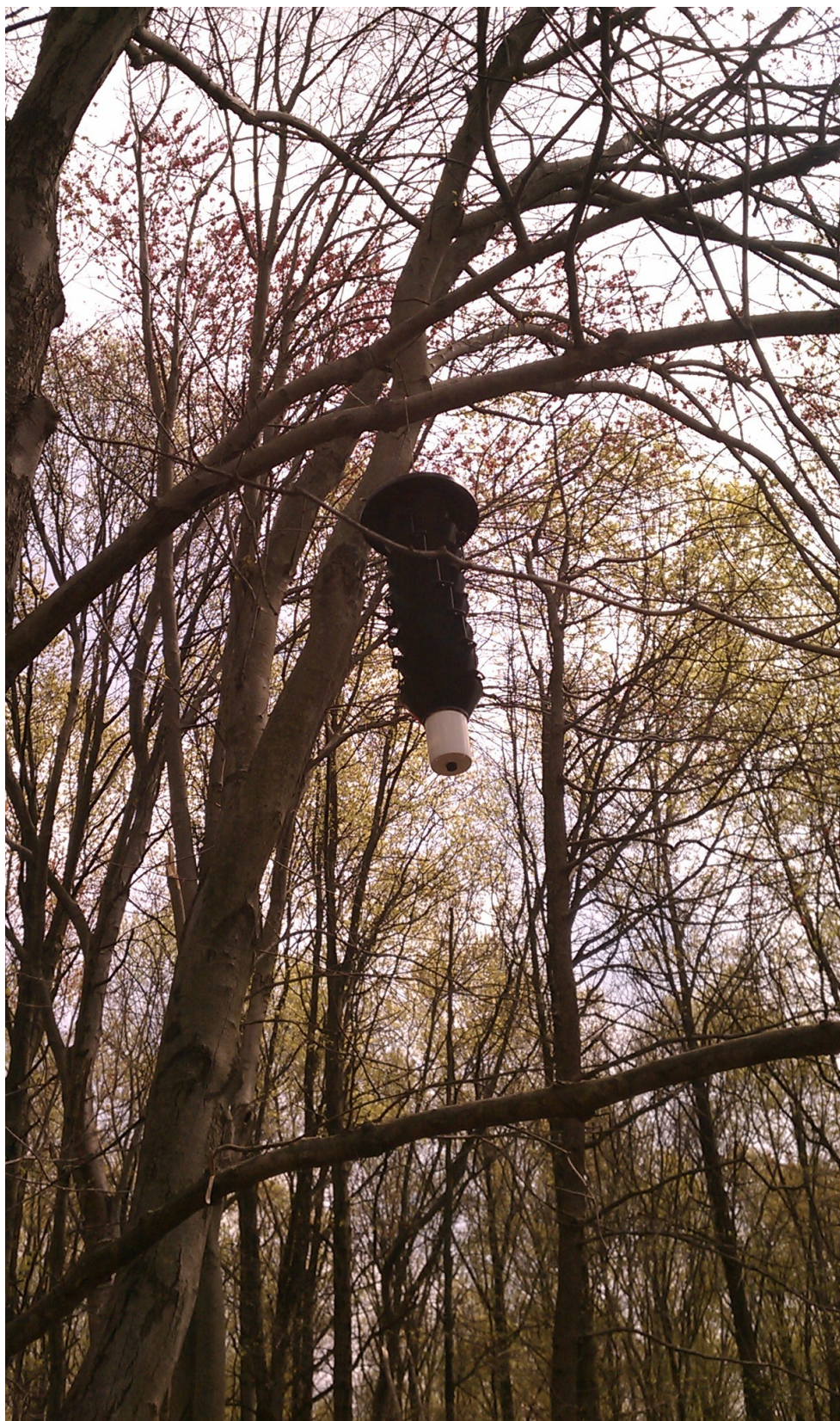
Figure 6: Trap 6 Fermented Bait