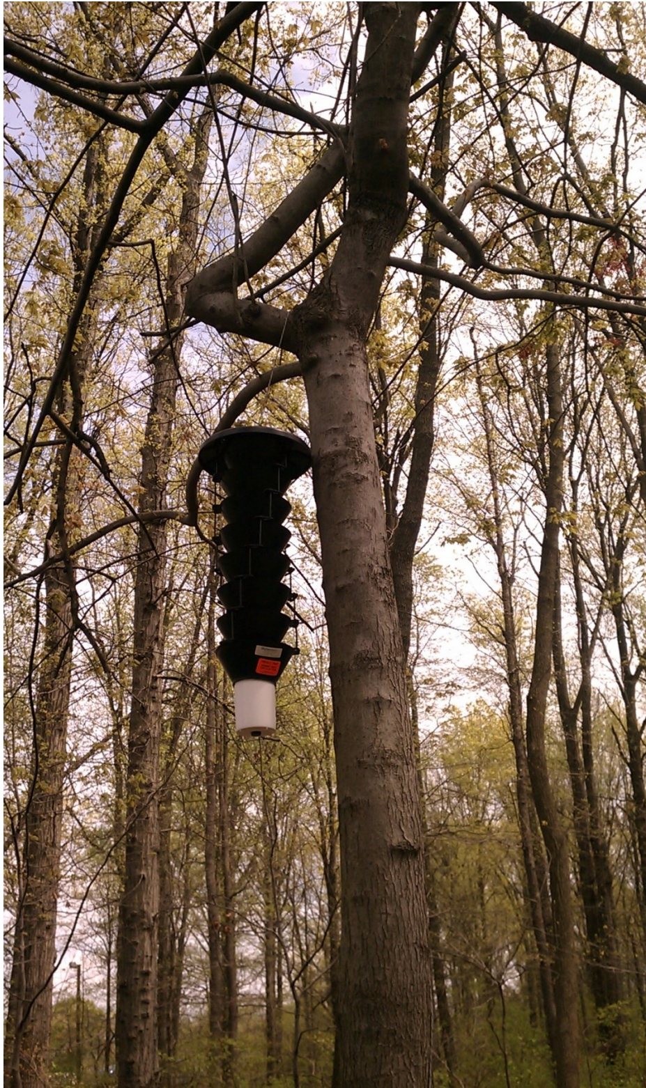
Figure 4: Trap 4 alpha-pinene