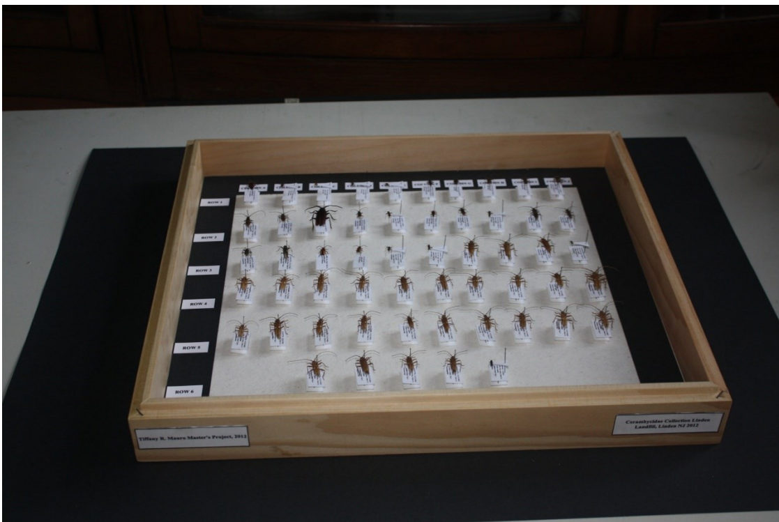
Figure 11: Cerambycidae Collection