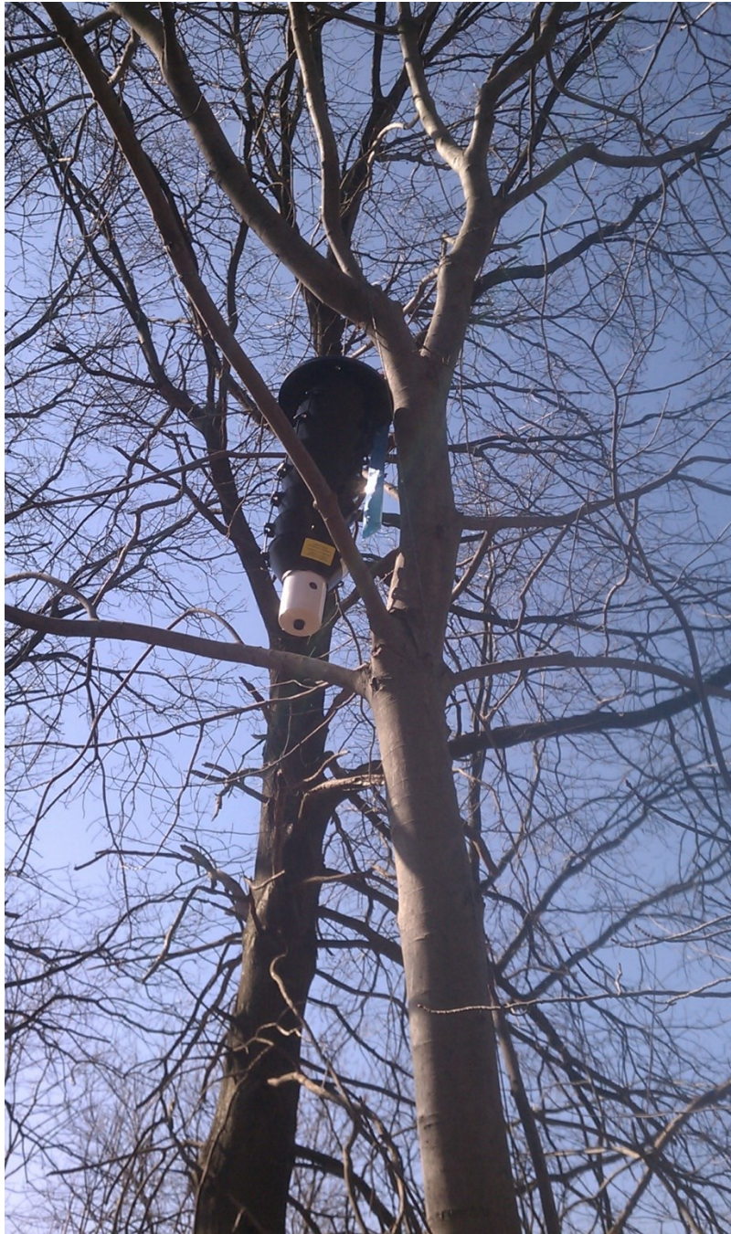
Figure 1: Trap 1 alpha-pinene