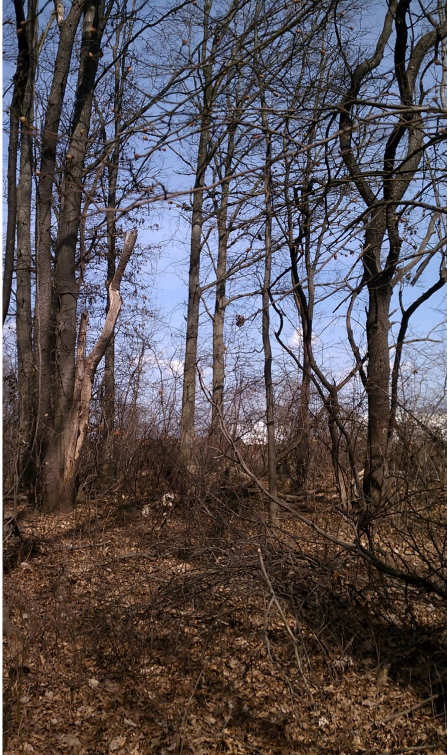
Figure 9: Linden Landfill Forest