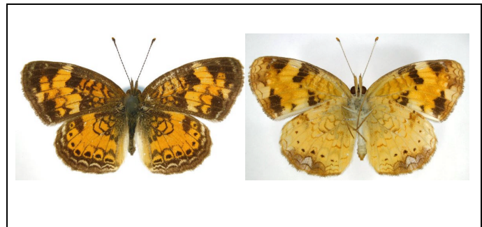
Fig. 1. P. incognitus . Edwards coll., Kanawha River, WV.

Occasional specimens of P. incognitus tend to have a heavy ventral forewing median line of black spots (the black is actually the ground color on all Phyciodes – the "spots" being the fulvous markings), and also very light ventral hindwings. These may be normal variants, or even hybrids with maconensis . But they can look very much like maconensis with which incognitus flies mid May to early June. These traits