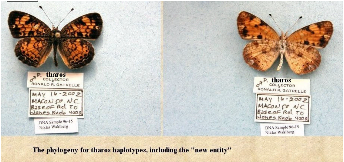
The phylogeny for tharos haplotypes, including the "new entity"