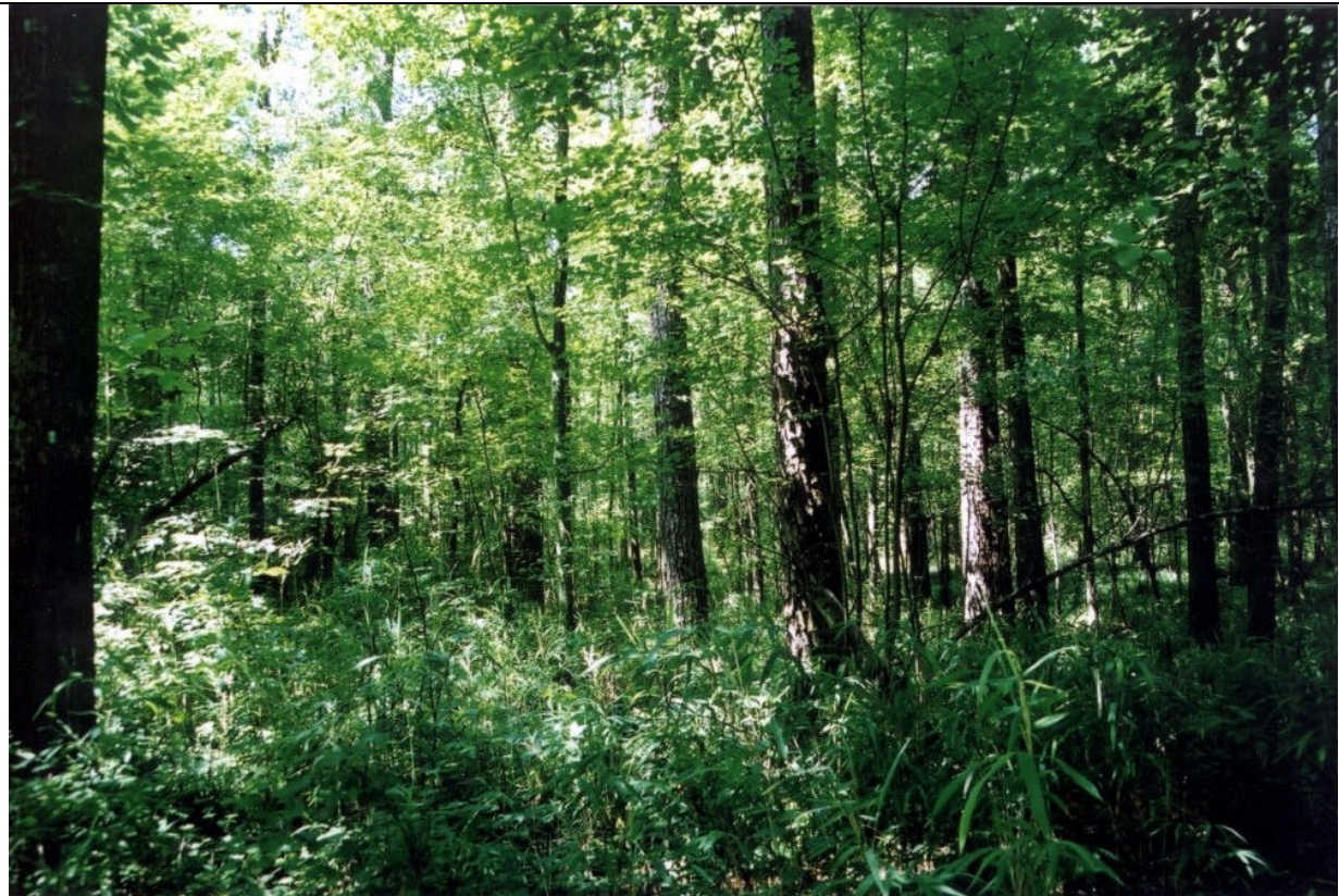
Below: Hale County site.