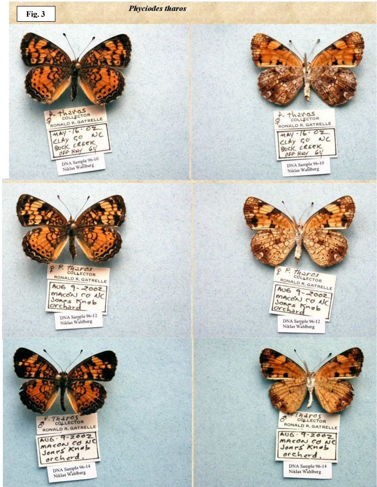
Fig. 2. The orange nudums of the clubs do not show up in these photos, but are very evident in hand. These three specimens are paratypes. Figs. 2-4. Specimens are fairly close to proportional to each other. All specimens are in the TILS / MOTH collection.