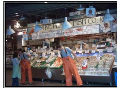
Historic Pike's Place Market

I mentioned just a few of the memorable things about the NAEOP conference. Everything went great, and I learned a lot. Thank you for giving me the opportunity to represent our university and state at the national conference.