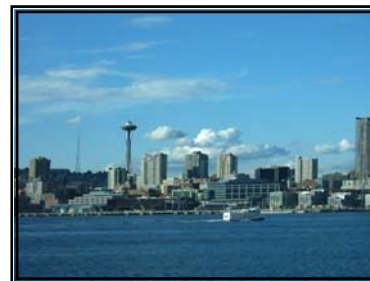
Beautiful Seattle skyline!