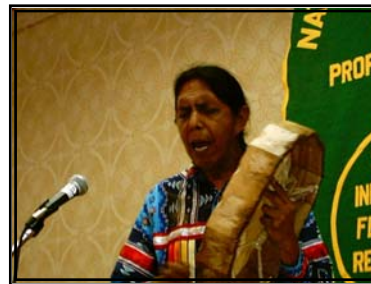
Entertainment before a General Session

I mentioned just a few of the memorable things about the NAEOP conference. Everything went great, and I learned a lot. Thank you for giving me the opportunity to represent our university and state at the national conference.