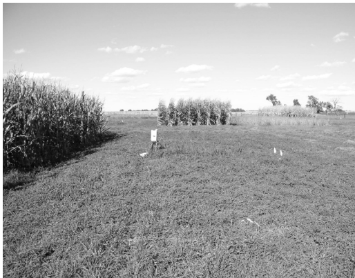
Research plots are yielding data that indicate using high-nitrate irrigation on grass results in net removal of nitrogen.