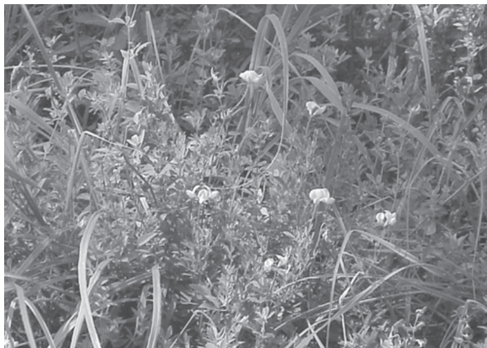
Birdsfoot trefoil in a smooth bromegrass-birdsfoot trefoil mixture at ARDC.

Our research to date indicates that a minimum of 10 to 25% of above-ground production, by weight, of a smooth bromegrass-birdsfoot trefoil mixture needs to be birdsfoot trefoil to achieve the positive yield responses mentioned above. Mixtures with as little as 10% birdsfoot trefoil are consistently as productive as non-fertilized smooth bromegrass, but generally are as much as 30% less productive than fertilized smooth bromegrass monocultures.