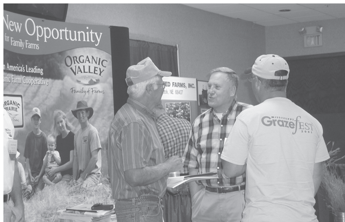
Nebraska Grazing Conference participants stop to chat in the exhibit room.

Proceedings from the 2005 and previous conferences are still available for $10 and $5, respectively. They contain the