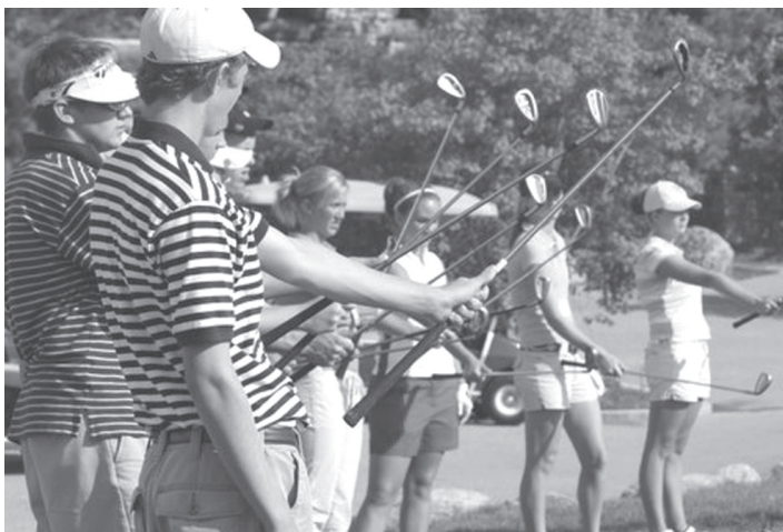
High school students receive instruction on proper golf club grips at the first ever Nike Golf Camp in Lincoln.

In Fall 2004 we began the first year of the PGA-accredited Professional Golf Management program with 31 students. We're very excited to report that this year we have a total of 74 PGM students who are busy attending class, studying, attending PGM meetings, and practicing and playing in tournaments at our partner courses.