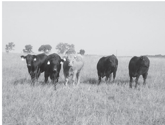
Cattle grazing a grass-legume mixture at ARDC.