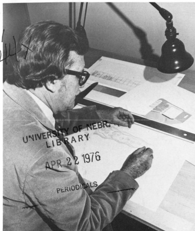
The plans on the exhibit designer's drawing table are usually the first indication that a new exhibit is underway.