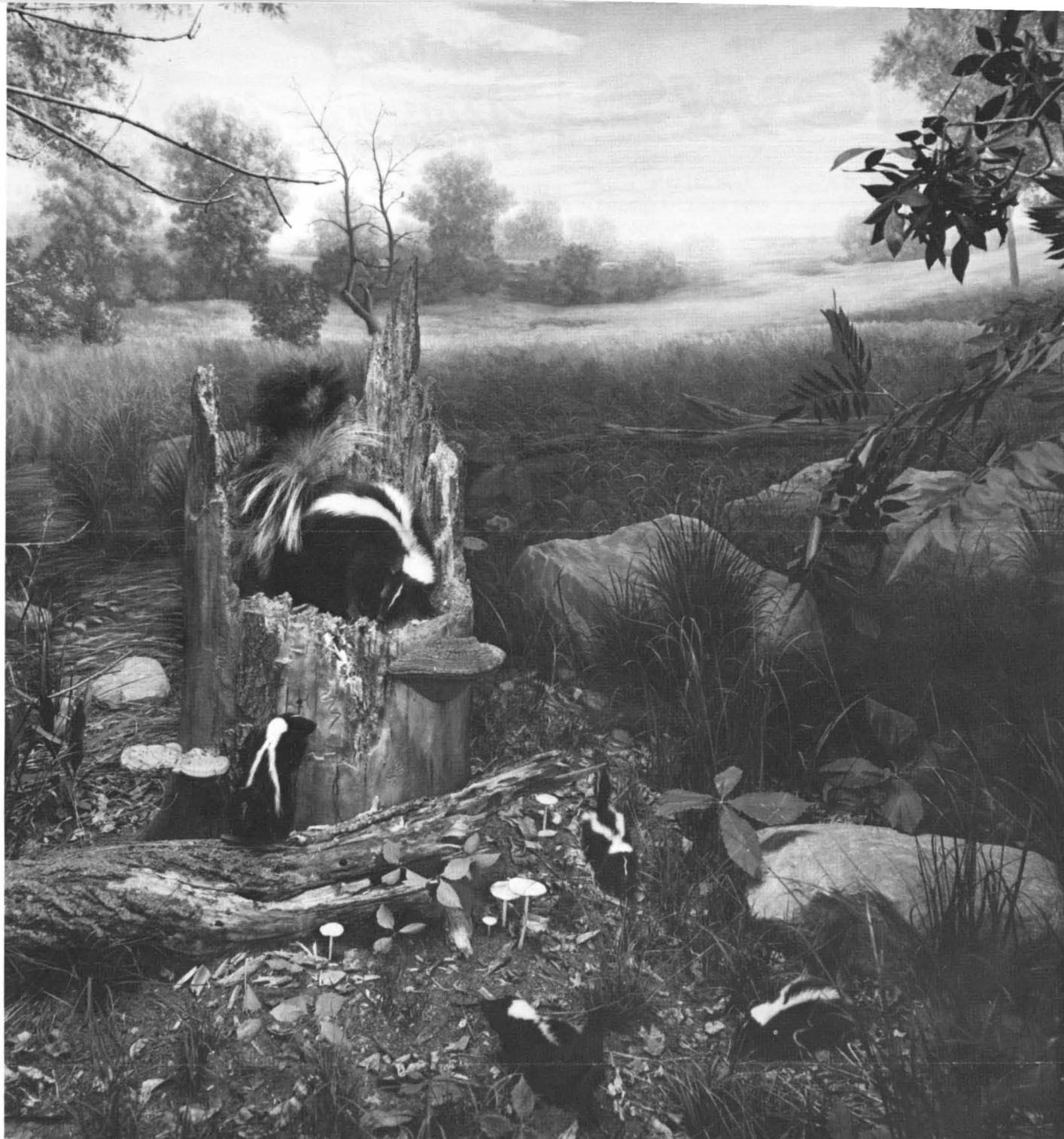
The large, apparently rotting tree stump in the skunk diorama has been modeled in paper mache.

snowstorm to pass so that habitat fieldwork could proceed in the Wildcat Hills.