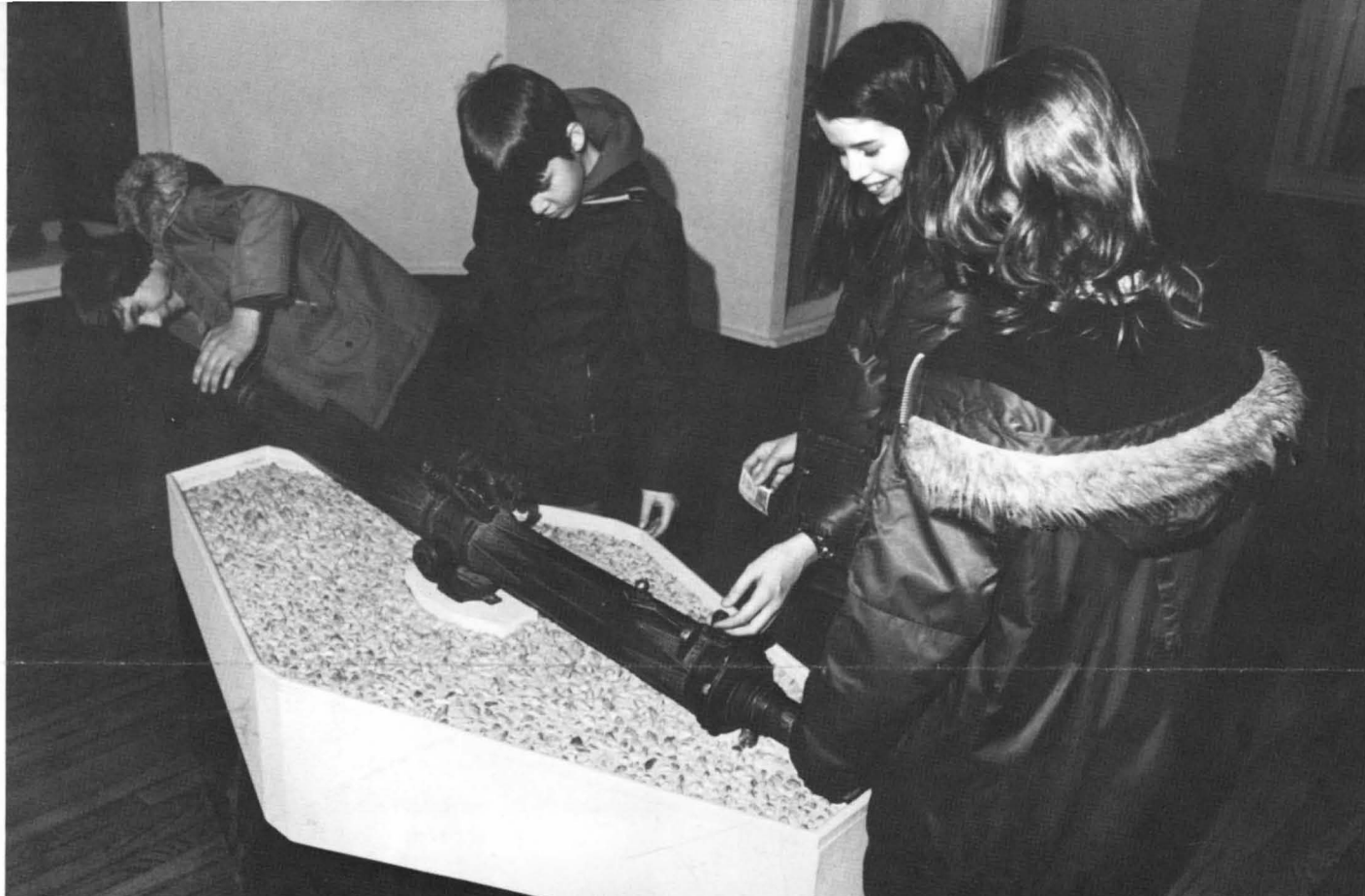
This small brass cannon from the Philippines is kept well polished by inquiring hands.

Museum illustrates what can be done with inexpensive materials. These little dioramas were made to illustrate various aspects of the life style in the Mesolithic period. The figures of people and animals as well as many of the accessories are made of such common materials as bits of wire, paper mache made from paper towels and white glue, and bristles from a scrub brush, all finished in living color from tubes of artist's watercolors and acrylic paints.