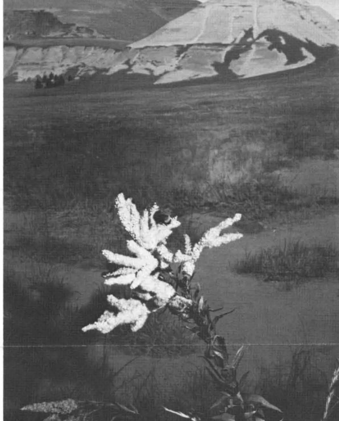
A bumble bee came to look and stayed to be looked at.

We are advised by a popular television commercial that "it isn't nice to fool Mother Nature," but it is possible to fool a bumble bee. A bumble bee paid me, as a museum artist, the highest compliment by flying through an open window of the studio and alighting on a goldenrod blossom which I had just fabricated. The bee seemed reluctant to leave the artificial flower, so we decided to collect the bee with the possibility of adding another touch of realism to the display. The curator of entomology was consulted to make sure the bumble bee was of a species appropriate to the exhibit site in west-