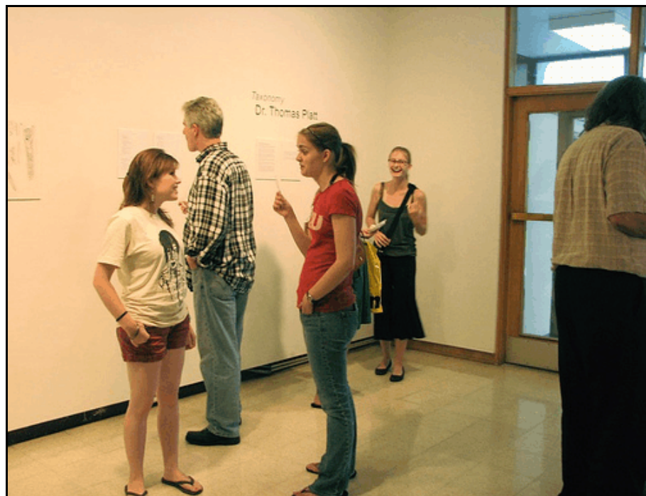
Fig. 2. Art aficionados becoming enthused about parasite biodiversity and taxonomy at the Moreau Gallery.