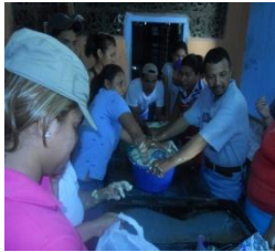
Participants meking mass For bread

6. The last workshop were last december, in which were 25 attendees some of them were INTA's technicians and practitioner from University Community Program (PCU). These students are making practices in INTA. Were 15 men and 9 women. In the workshop was present the owner of the baker, she was learned all about sorghum flour.