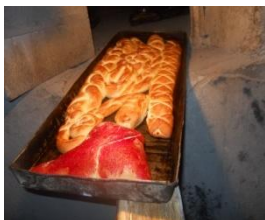
Simple bread roasted