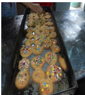
Roasted cookies 100% sorghum