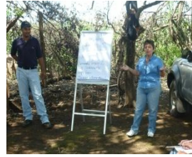
Explaining properties and characteristics of sorghum flour