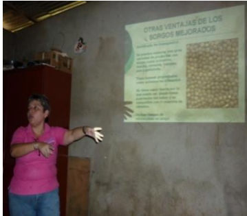
Training people from INTA South Pacific

Now, they add sorghum products as atole, picos, cakes etc. and some others drinks. They liked all the products, but overall atole, because here in Nicaragua, atole can find liquid and solid, but not powder atole and now they can sell instantaneous atole and people can keep around one month. They were in International