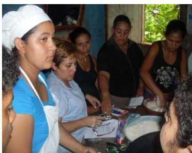
Explaining how to do bread