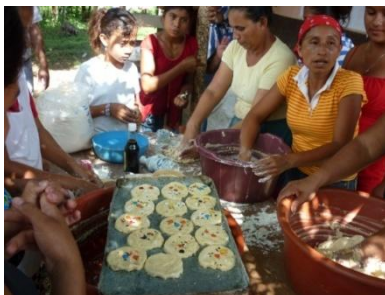
Women making cookies 100% sorghum flour