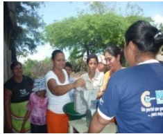
Milling sorghum grain