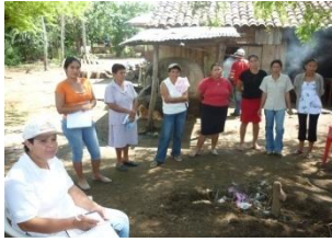
Participants from el Terrero