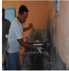
rolling simple bread

7. Other of the group had been trained in Nueva Guinea it is South Atlantic Regions (RAAS), in this occasion were women from different groups, individual and cooperative's women. They have done bread from yuca and now they want to implement sorghum technology. In this place were trained 8 men and 17 women.