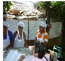
Milling sorghum grain for drink (Tiste 100% sorghum)