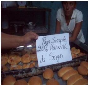
Simple bread 20% sorghum flour