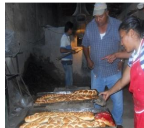
behind of bread is the artisanal oven