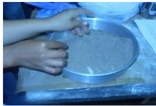
Horchata 100% sorghum