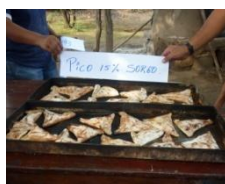
Cake 80% sorghum flour