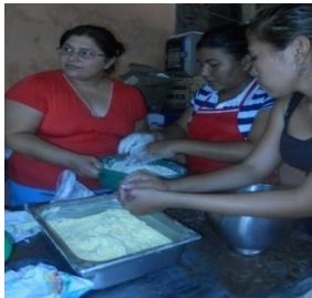
The baker's owner made a Cake 80% sorghum flour