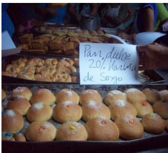
Sweet Sorghum bread (20% sorghumflour)