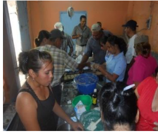
everybody is making bread, cookies etc.