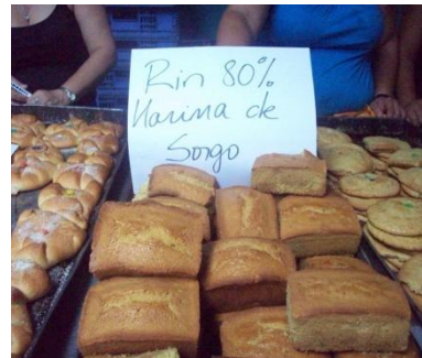
Pudines or Rines 80% sorghum flour