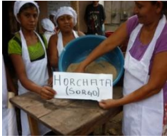
Horchata roasted sorghum flour (100%)