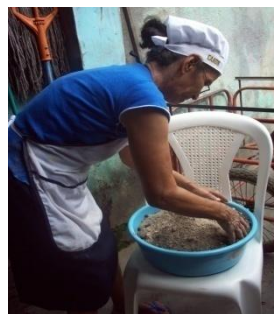
Horchata 100 % sorghum flour