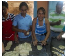
Making sorghum bread (15% sorghum)