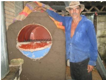
Oven in the community