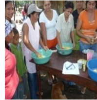
preparing mass for bread