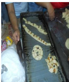
Bread with jelly