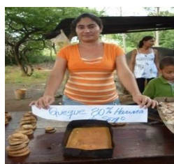
Cakes 80% sorghum flour