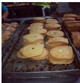
Cookies 100% sorghum