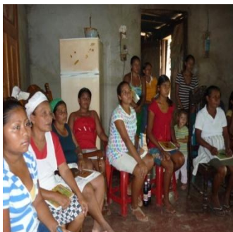
Attendees in Nandaime- INTA South Pacific