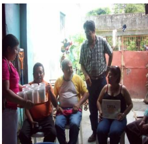
Drinking horchata from sorghum flour