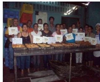
every participant with their certificate