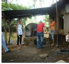
bakering sorghum bread

6. The last workshop were last december, in which were 25 attendees some of them were INTA's technicians and practitioner from University Community Program (PCU). These students are making practices in INTA. Were 15 men and 9 women. In the workshop was present the owner of the baker, she was learned all about sorghum flour.