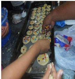
Cookies 100% sorghum