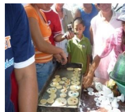
cookies 100% sorghum flour