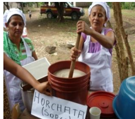
Making sorghum bread