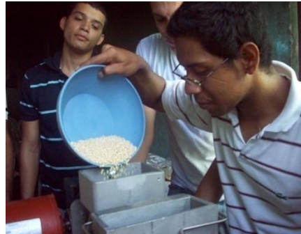
Students from Leon University (UNAN) are Explaining about sorghum mill because They are making their thesis with sorghum flour