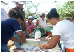
Making mold for bread