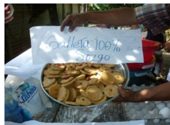
Workshop in Masaya sorghum cookies 100% sorghum