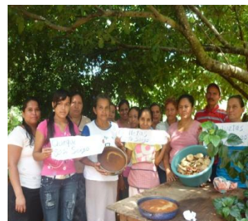
Somotillo group with sorghum flour products