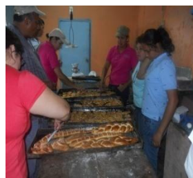
Bread 15% sorghum