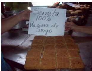
Semita without black honey 100% sorghum flour