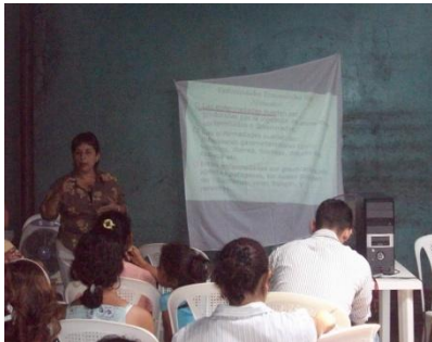
Introduction about sorghum flour

Jicaral group were attended 5 women and 1 man. Anyway, they are producing sorghum flour and bread and are selling by Jicaral population.