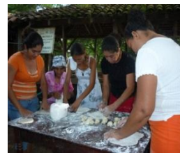
making simple bread 15% sorghum flour