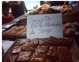
Semita with black honey 80% sorghum flour