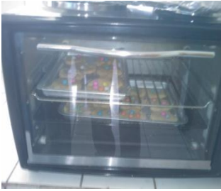
Cookies 100% sorghum flour