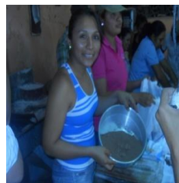
Sorghum Tiste 100%