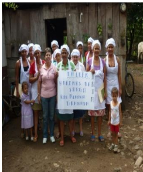
Trained group from Nandaime-INTA South Pacific