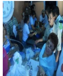
Weighing flour and other ingredients