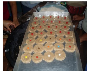
Women cleaning sorghum