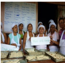
Pan simple and Pico 20% sorghum flour