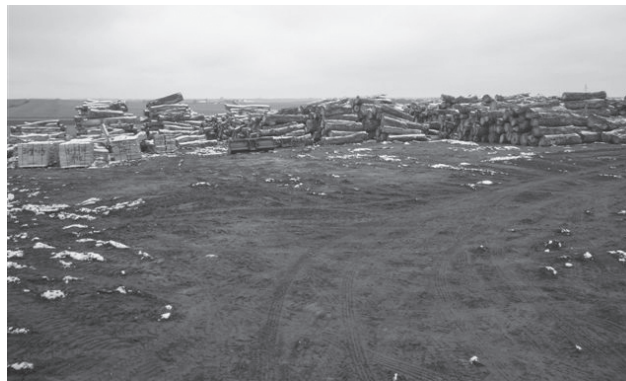
Wood Solutions Log Deck.

foot diameter log by cutting horizontal and then rotating the blade to cut vertical. Waste slabs are chipped and sold for mulch or biomass fuel. A large volume of woodchips was recently sold for supplemental fuel at an ethanol plant in South Dakota.