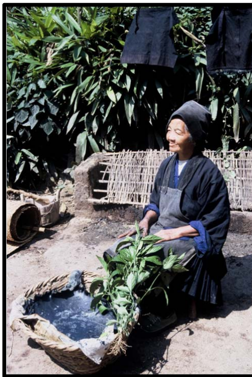
Figure 2, Indigo dye paste and the plant source, Strobililanthus flaccidifolius, Guizhou province, China, 1993.

When researching and carrying out much indigo fieldwork, often in little visited parts of the world, such as isolated villages in south-west China, Mali and Bangladesh, I became intrigued and fascinated by cross-cultural comparisons and social uses of indigo, and amazed by the variety and beauty of indigo-dyed textiles and the creativity of the makers. (Fig 2)