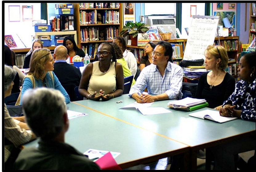
Figure 4, Yo Yo Ma, with members of Silk Road Connect (including Jenny Balfour-Paul) discussing the indigo project with teachers at P45 school in Harlem.

After The Silk Road Project ran a successful creative, collaborative, project in Chicago in 2006 and developed a curriculum for middle school and secondary students called ‘Along the Silk Road’ with the Stanford Program on International and Cross-Cultural Education (SPICE), Ma sought was an educational ‘spark’ to inspire ‘passionate learning’ in students and educators in ‘under-served’ schools in New York City. He heard Ben Haggerty, British storyteller of the Silk Road Ensemble, recount an African tale of how indigo came down to earth from the sky so people could capture its colour in their clothes, and this tale ignited the ‘spark’. Ma began to explore the subject of indigo, which included reading Indigo and encouraging members of his Silk Road Project team to visit ‘Blue’ at the Textile Museum. The more he discovered the more he saw the potential of using indigo as ‘a gateway by which students can connect the personal experiences of their everyday lives (for example, blue jeans) with the history, geography and culture of the rest of the planet’.