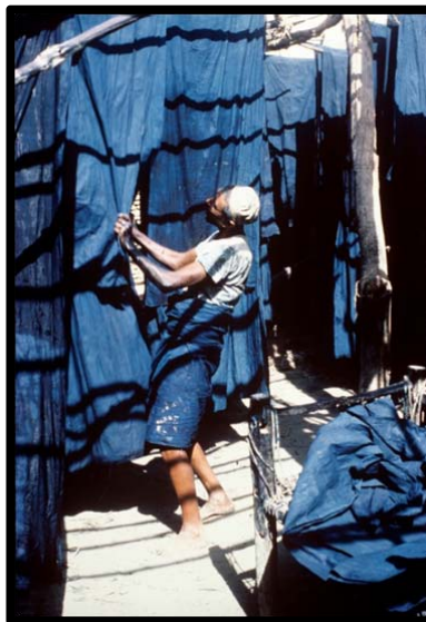
Figure 1, Dyeing with indigo, Bayt Muhammad 'Ali Abud, Zabid, Yemen, 1983.

A lifelong delight in ethnographic textiles and all aspects of natural dyes was ignited in me after traveling overland to India and Sri Lanka, and working and living in the Arab world in the 1970s. Back in UK in the early 1980s, while working as a textile artist and teacher of fabric printing and dyeing, I had the chance to visit Yemen, where I found its ancient indigo industry on the verge of dying out. (Fig.1) I was encouraged to return there to record its history and traditional uses and subsequently to extend this research to the rest of the Arab world. Indigo, featuring in Egyptian mummy wrappings by 2,000 BC, was widely used until the later twentieth century throughout the Middle East and North Africa in all kinds of textiles, as well as in cosmetics and medicines. This research became a PhD, later published, and led to a book on indigo worldwide for the British Museum Press, as well as an Honorary Research Fellowship in the Institute of Arab and Islamic Studies at Exeter University and Fellowships of London's Royal Geographical Society and New York's Explorers Club.