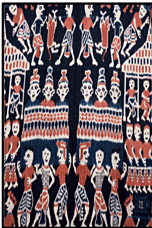
Figure 3, Ikat indigo cloth (detail) from Sumba Island, dyed in indigo and morinda red.

dyed items a permanent blue, with desirable fading qualities due to multiple dips, and also makes indigo compatible with any type of fiber, unlike many natural dyes that are best suited to absorbent animal fibers such as wool and usually require an intermediate chemical substance, called a mordant, and high temperatures to bond to fibers. Indigo dyers passed their secrets down the generations and many superstitions and rituals arose because of the mysterious changes that take place during the dyeing process, bestowing a mystique that in turn gave rise to fascinating social and ceremonial uses. (Fig 3)