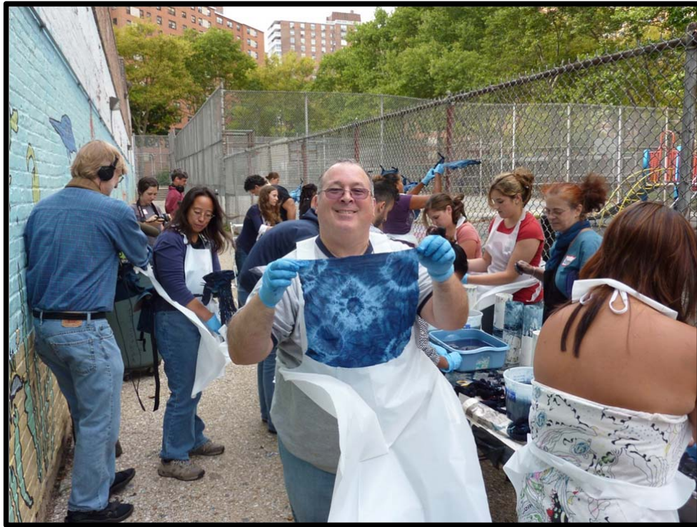
Figure 5, Teachers dyeing with indigo at the training workshop in Harlem in 2009.