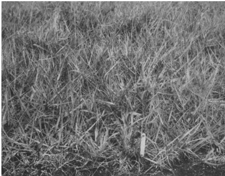
FIG. 3. Detail of Sporobolus cryptandrus in a former bluegrass pasture on June 15, 1938. The plants, which have not yet been grazed, are 6 inches tall.

When drought comes the leaves roll tightly, the osmotic pressure rising from 10 or 12 to 35 or 40 atmospheres. But soon they unroll and resume photosynthetic activity even after relatively light showers. This is due to the excellent provision for absorption in the surface soil.