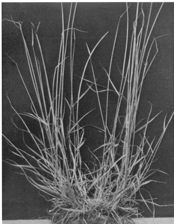
FIG. 1. A fine plant of Sporobolus cryptandrus about 3 feet tall. Note the basal spreading of the stems and the openness of the bunch.

This grass is a tufted perennial of xeric habit. In general the tufts are small but the larger bunches may have a basal diameter of 5 or 6 inches and 30 to 50 leafy stems, which form an open crown (fig. 1). The pithy, solid stems are mostly erect but some usually spread outward at various angles or may even grow parallel to the soil surface. Even vertical stems often spread outward at the base. The leaves are usually 5 to 12 inches long. They are