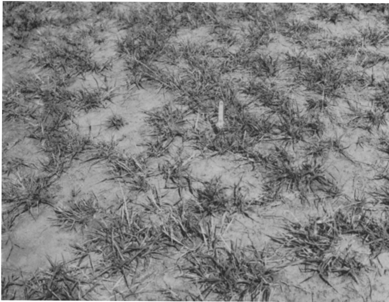
FIG. 2. A thin stand of sand dropseed in a heavily grazed pasture showing the new growth of leaves on April 24, 1938.

Growth is fairly rapid and if the plants are ungrazed a height of six or more inches is attained by the middle of June (fig. 3). Production of flower stalks begins about June 15, and during favorable seasons they are borne in great profusion and attain a height of 3 feet. But during dry years they may be reduced to one-third the normal size. The pale or leaden to purplish panicles are partly enclosed in the topmost leaf sheaths. The unenclosed portion spreads somewhat but the panicle is usually narrow. The larger ones are often 15 inches long. Blossoming begins late in June and may continue until October.