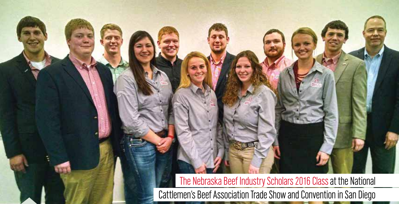
The Nebraska Beef Industry Scholars 2016 Class at the National Cattlemen's Beef Association Trade Show and Convention in San Diego