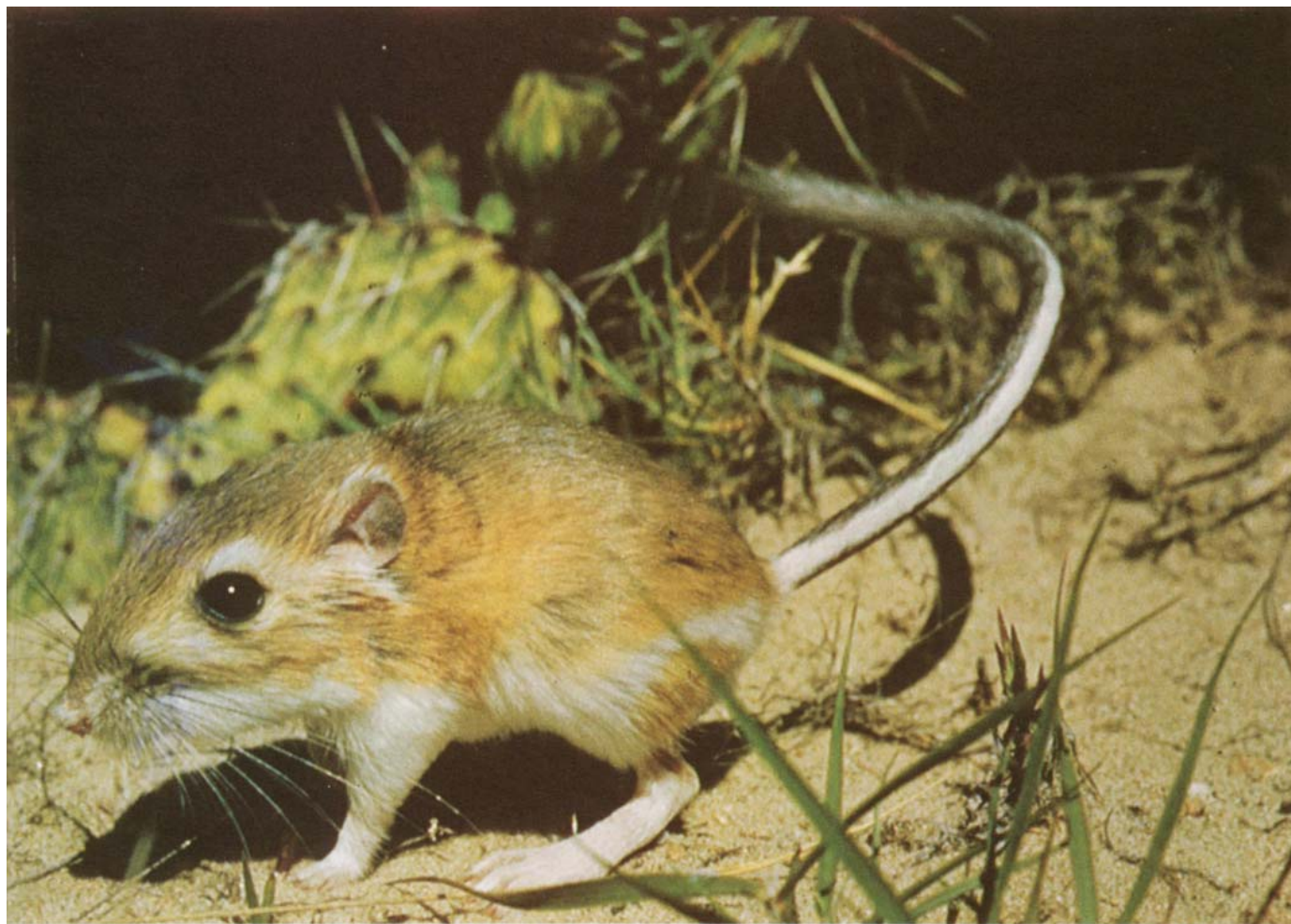
Ord's kangaroo rat

habitats for many different types of mammals. The drier upland Sand Hills have an abundance of plains pocket gophers, plains pocket mice, Ord's kangaroo rats, prairie voles, and deer mice. Wet areas are characterized by the masked shrew, jumping mouse, meadow vole, and muskrat. The open areas, such as ridge tops and blowouts, tend to be the best microhabitat for kangaroo rats, which are bipedal and fast-moving; the dense grass microhabitat is favored by voles, which are quadrupedal and slow moving. Typically, kangaroo rats are from western, drier habitats, and voles are from eastern, moister habitats. In the Sand Hills, however, these two mammals occur together because of the mosaic of sand and grass (Lemen and Freeman, 1986).