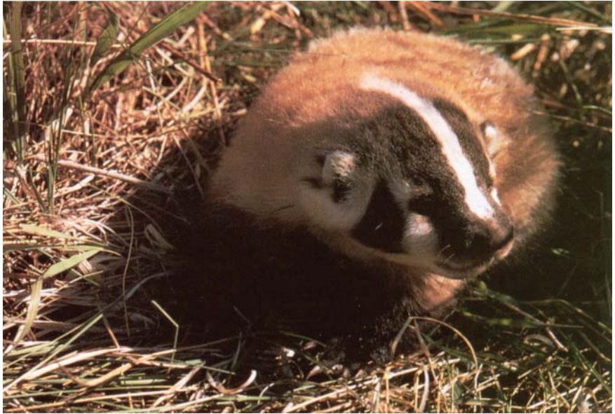
Soil Conservation Service