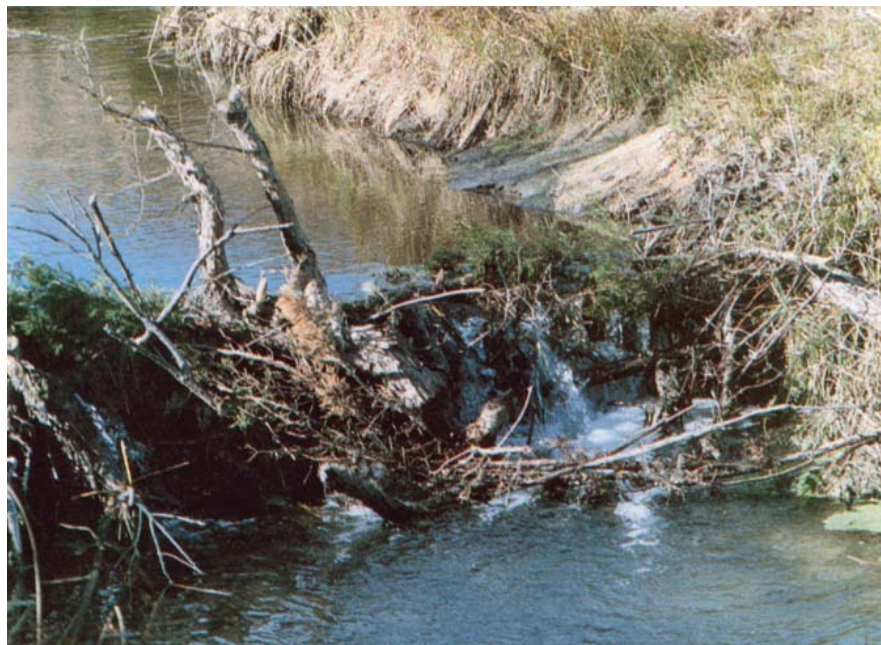
Beaver dam, North Fork of Birdwood Creek, McPherson County

The northern grasshopper mouse is a grassland species whose distribution extends beyond the Sand Hills to the east, but it is probably restricted by tall-grass prairie. It can be found in the upland Sand Hills community. This mouse is more common in the western part of the state than in the eastern part but is not commonly trapped in either area. Grasshopper mice are known to have large