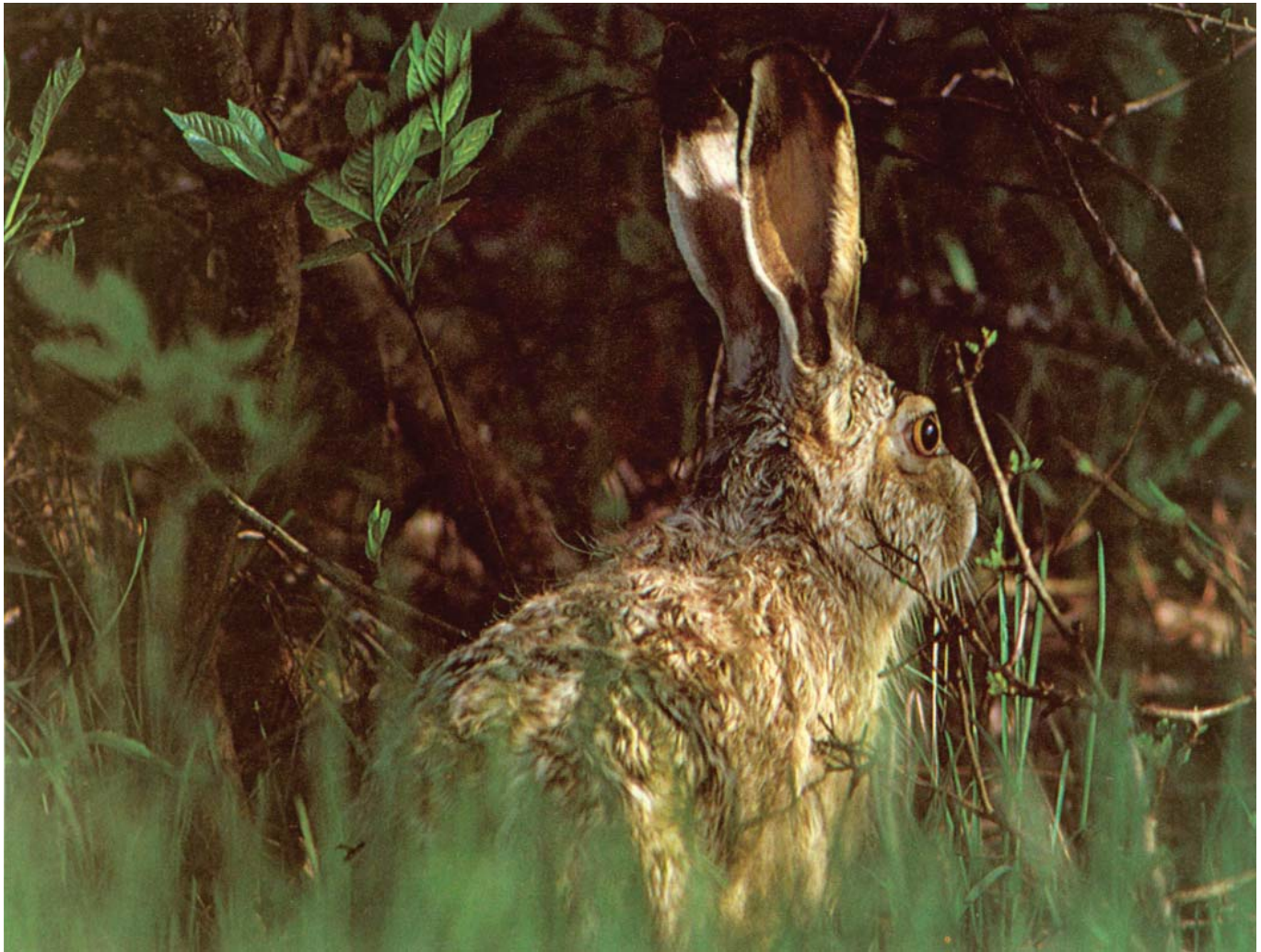
Nebraska Game and Parks Commission