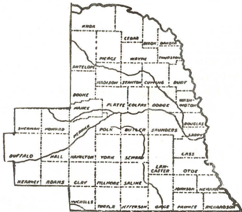
COUNTIES ELIGIBLE UNDER 9c.