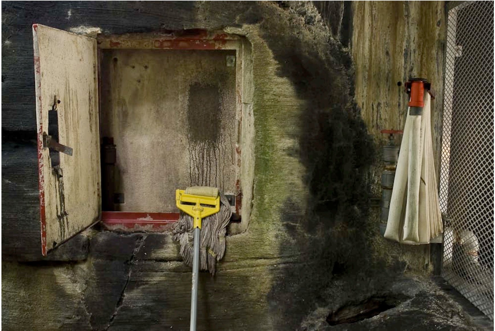
Mop, Biosphere 2