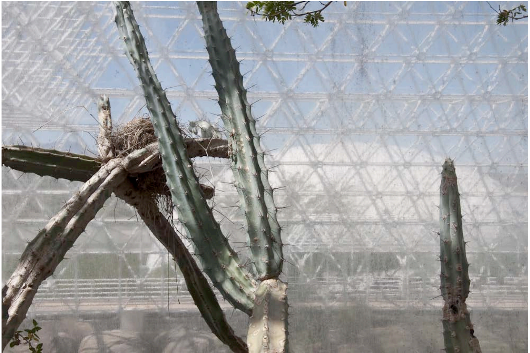
Nest, Biosphere 2