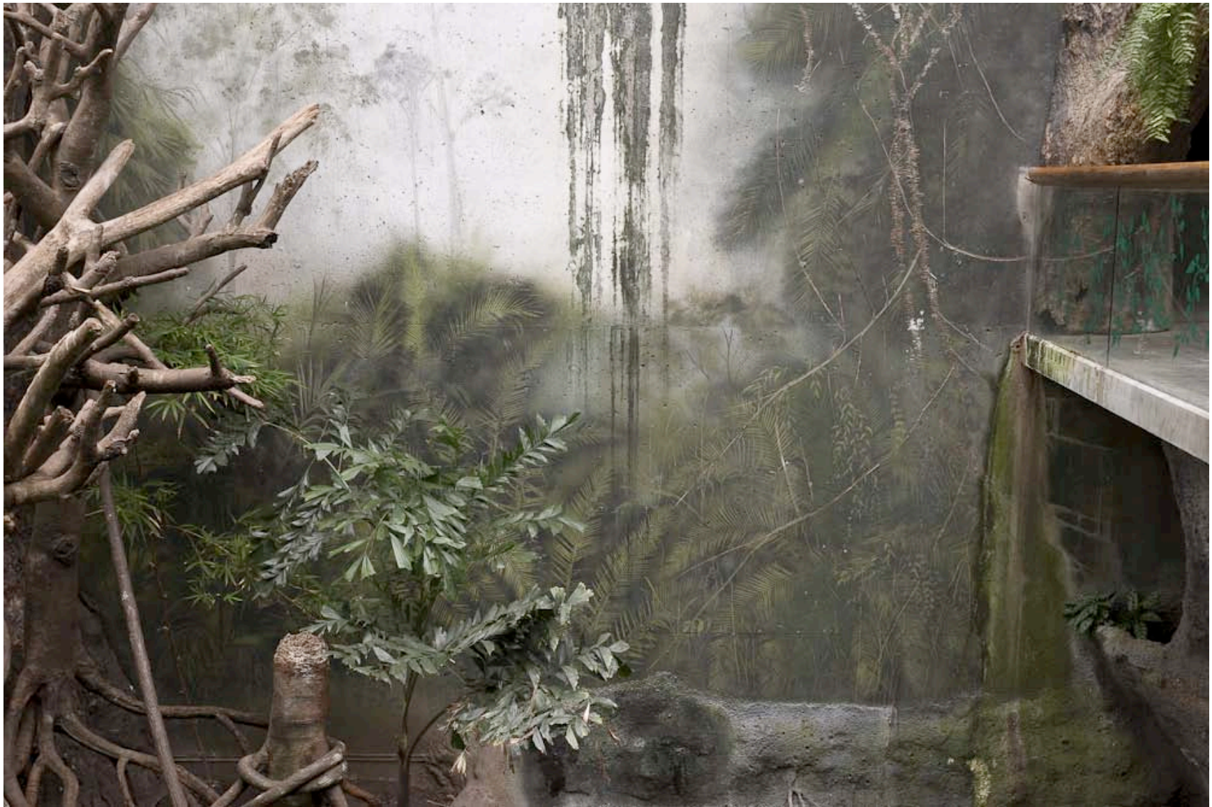
Painted Leaves and Dripping Moss, Lied Jungle