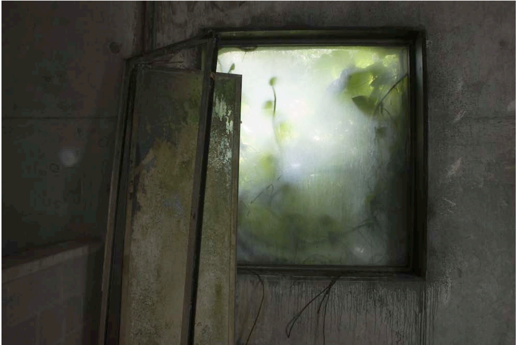
Rain Forest Back Room, Biosphere 2