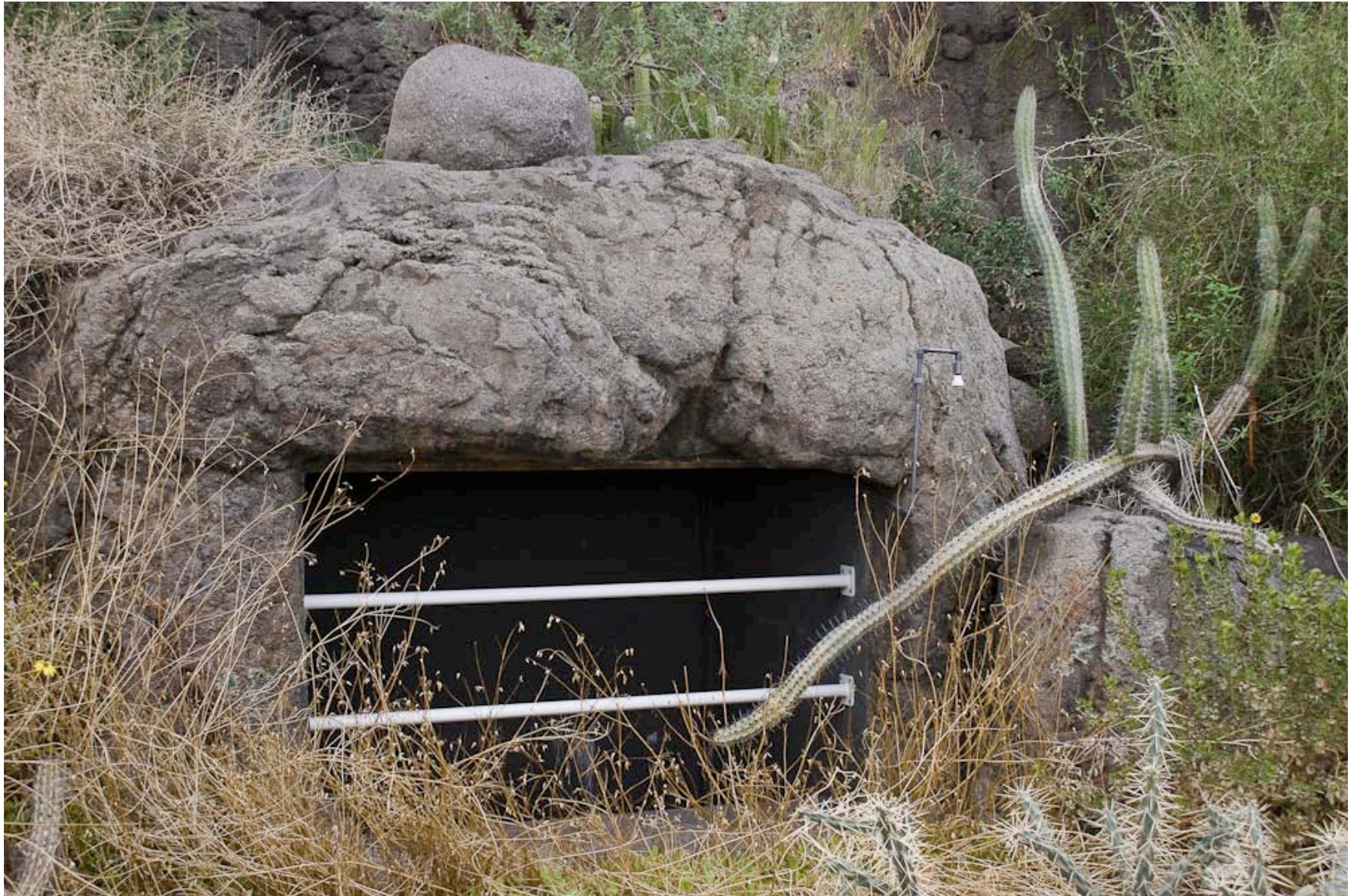
Curious Cactus, Biosphere 2