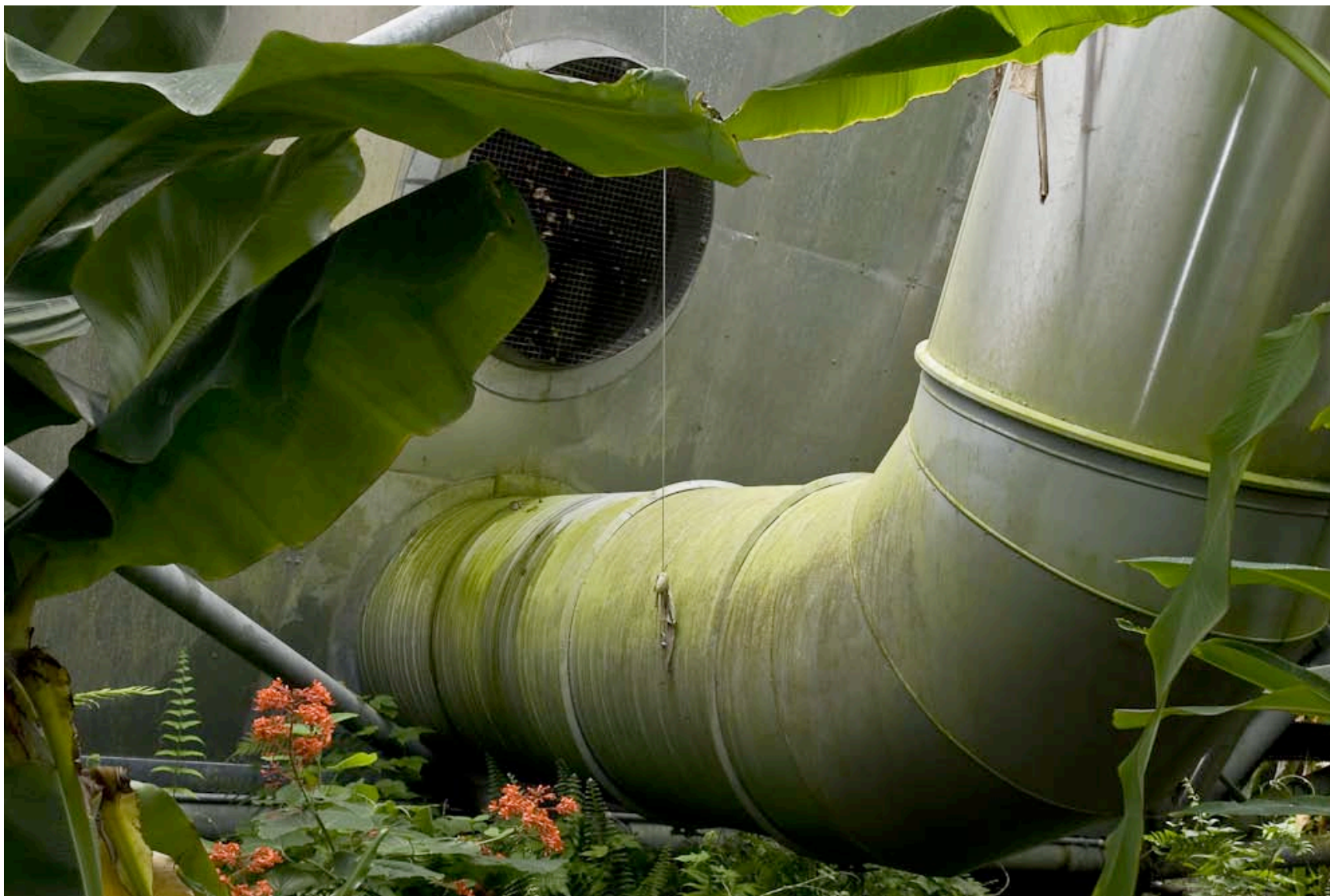
Green Ductwork, Eden Project