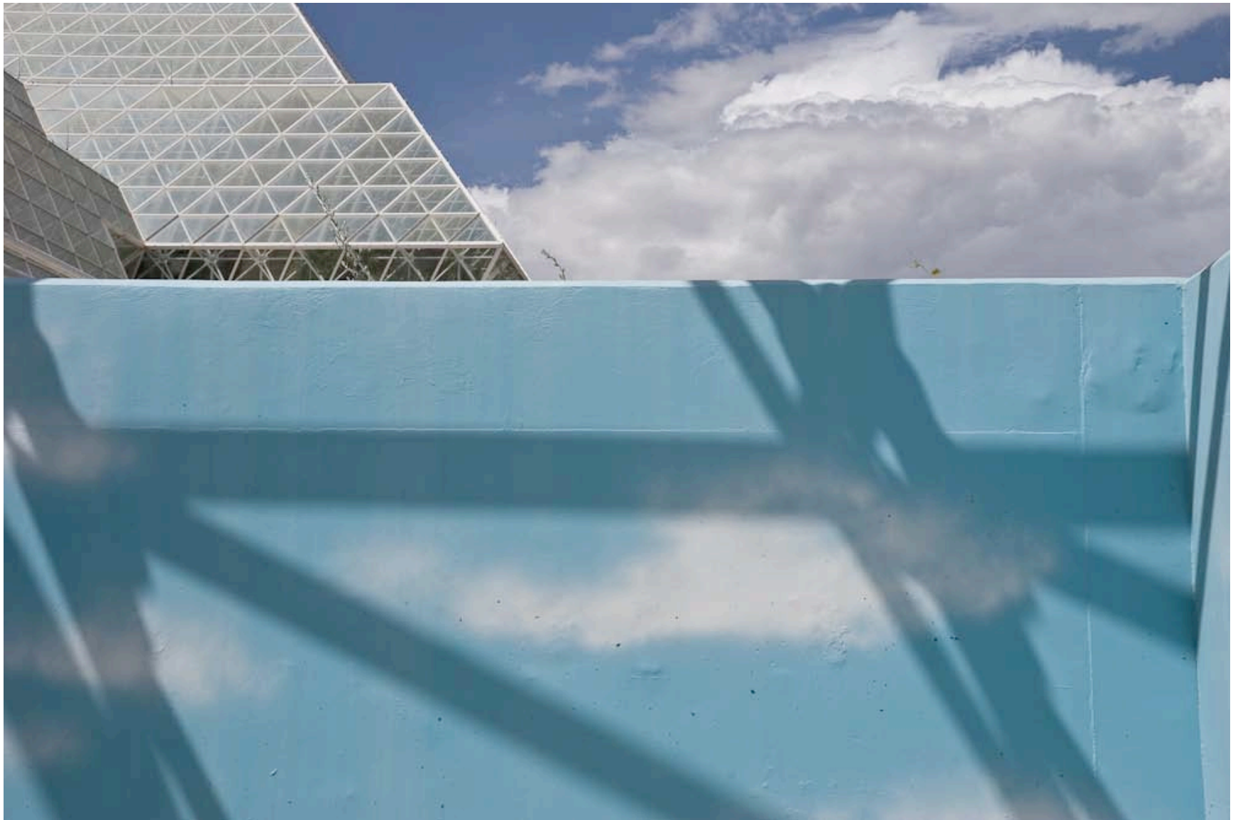
Painted Clouds, Biosphere 2