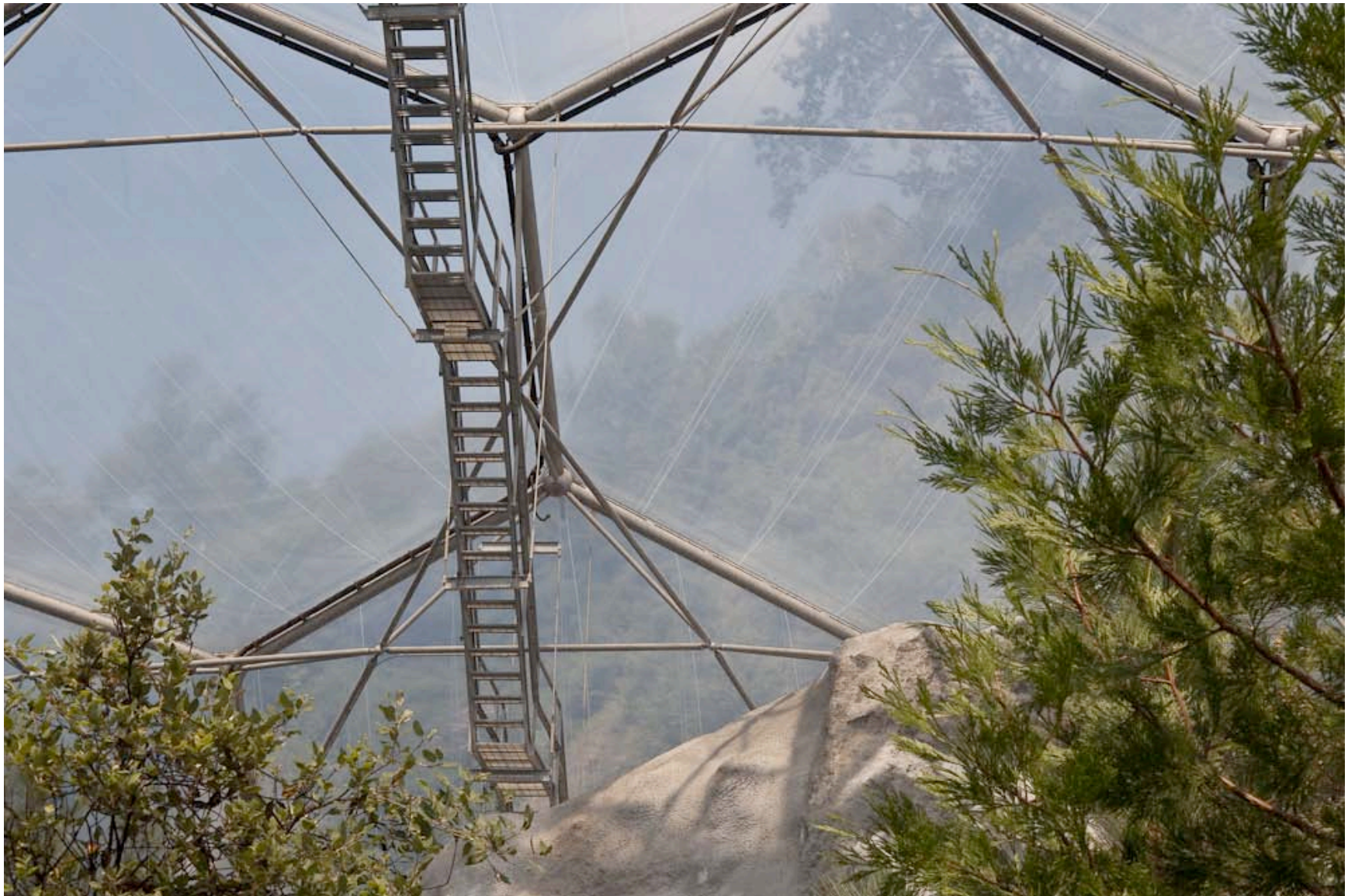
Stair, Eden Project