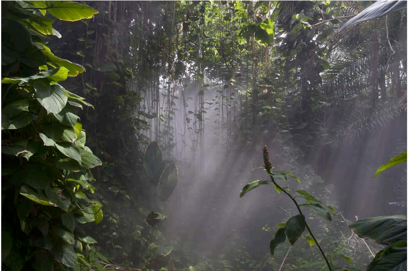
Rain Forest Mist, Biosphere 2