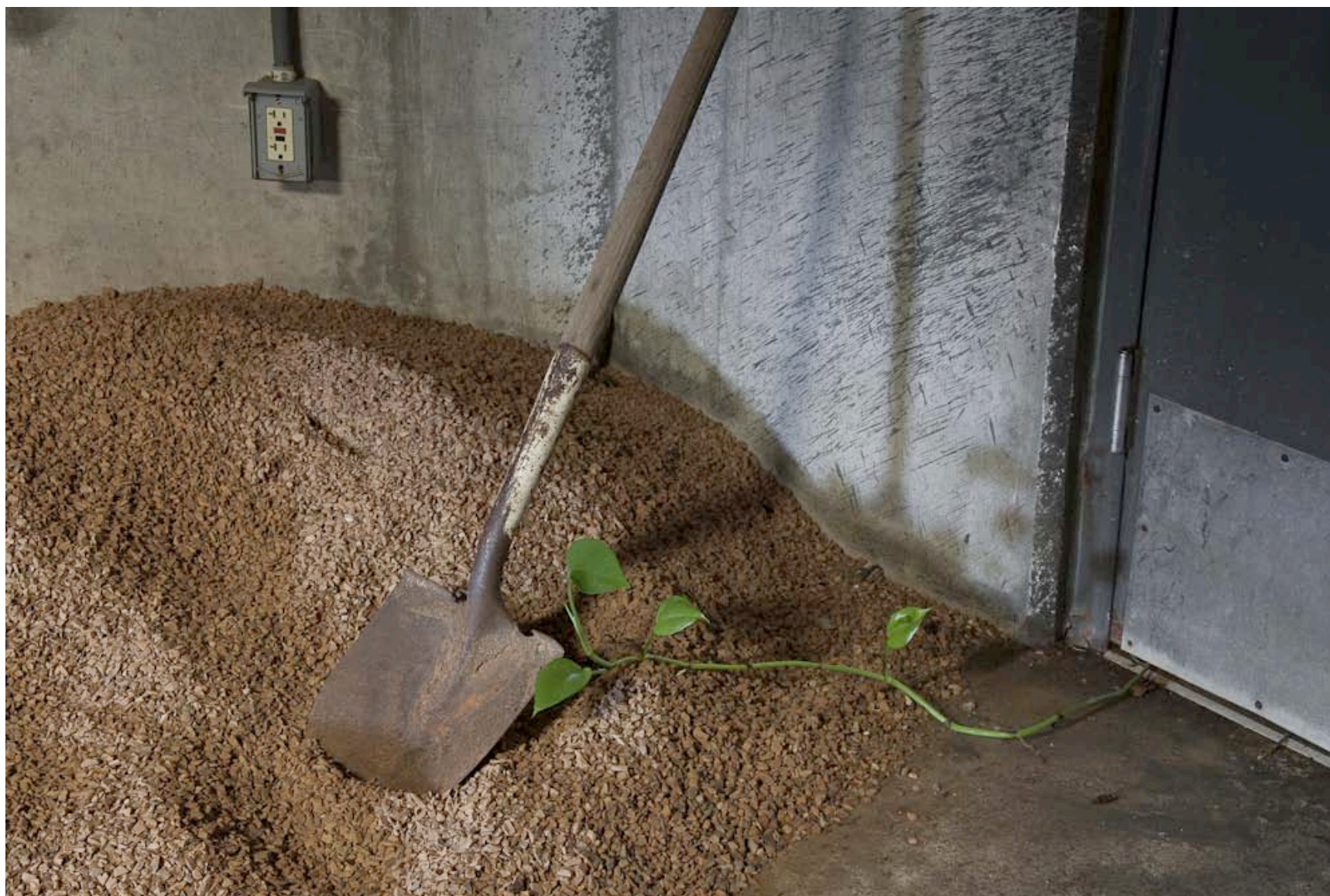
Shovel, Biosphere 2