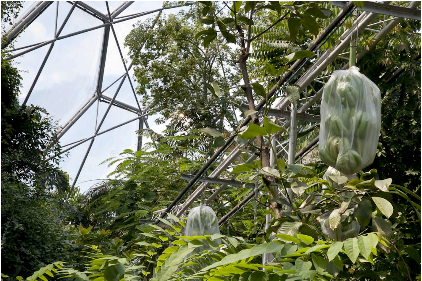
Banana Conveyor, Eden Project