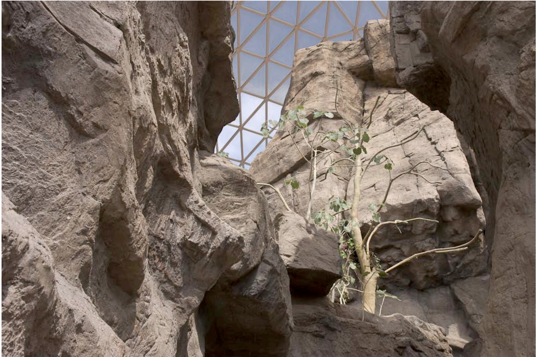
Canyon, Desert Dome