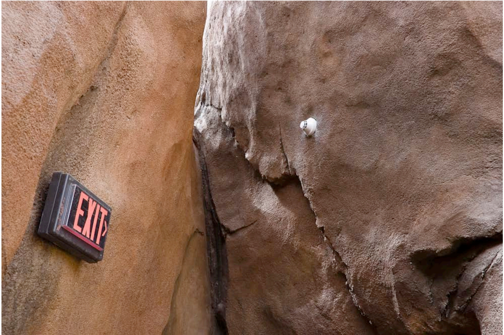
Exit, Desert Dome