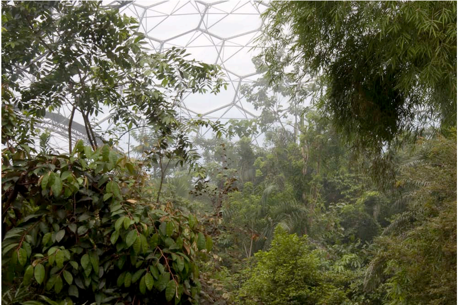
Humid Tropics, Eden Project