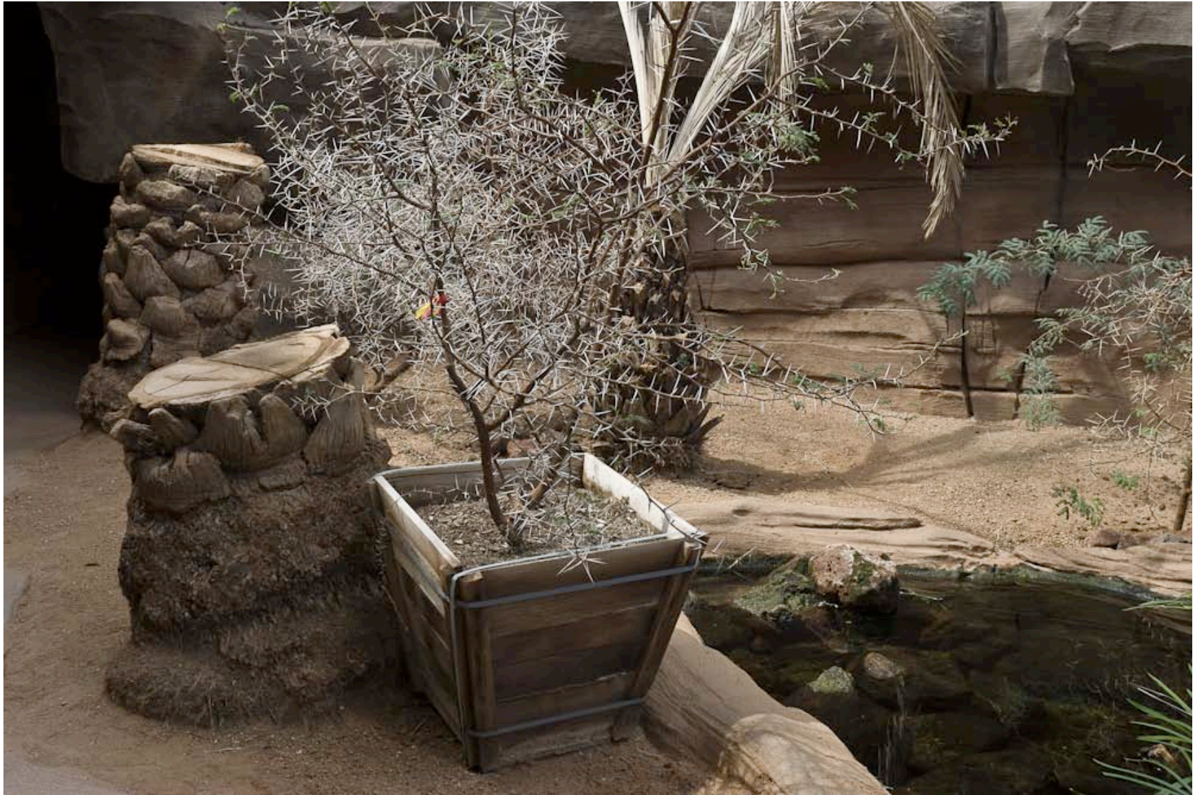
Palm Stump and New Tree, Desert Dome