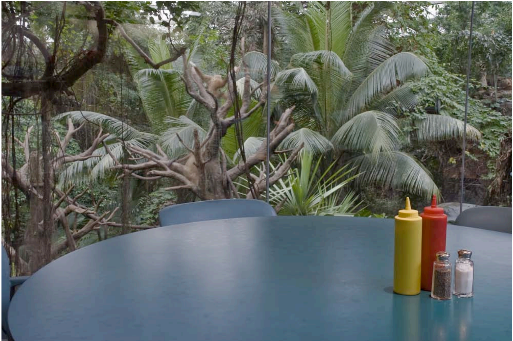
Condiments, Lied Jungle