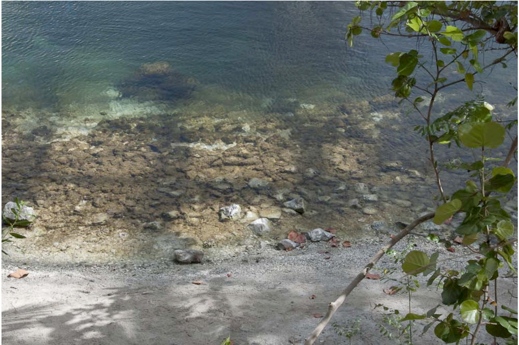
Beach, Biosphere 2