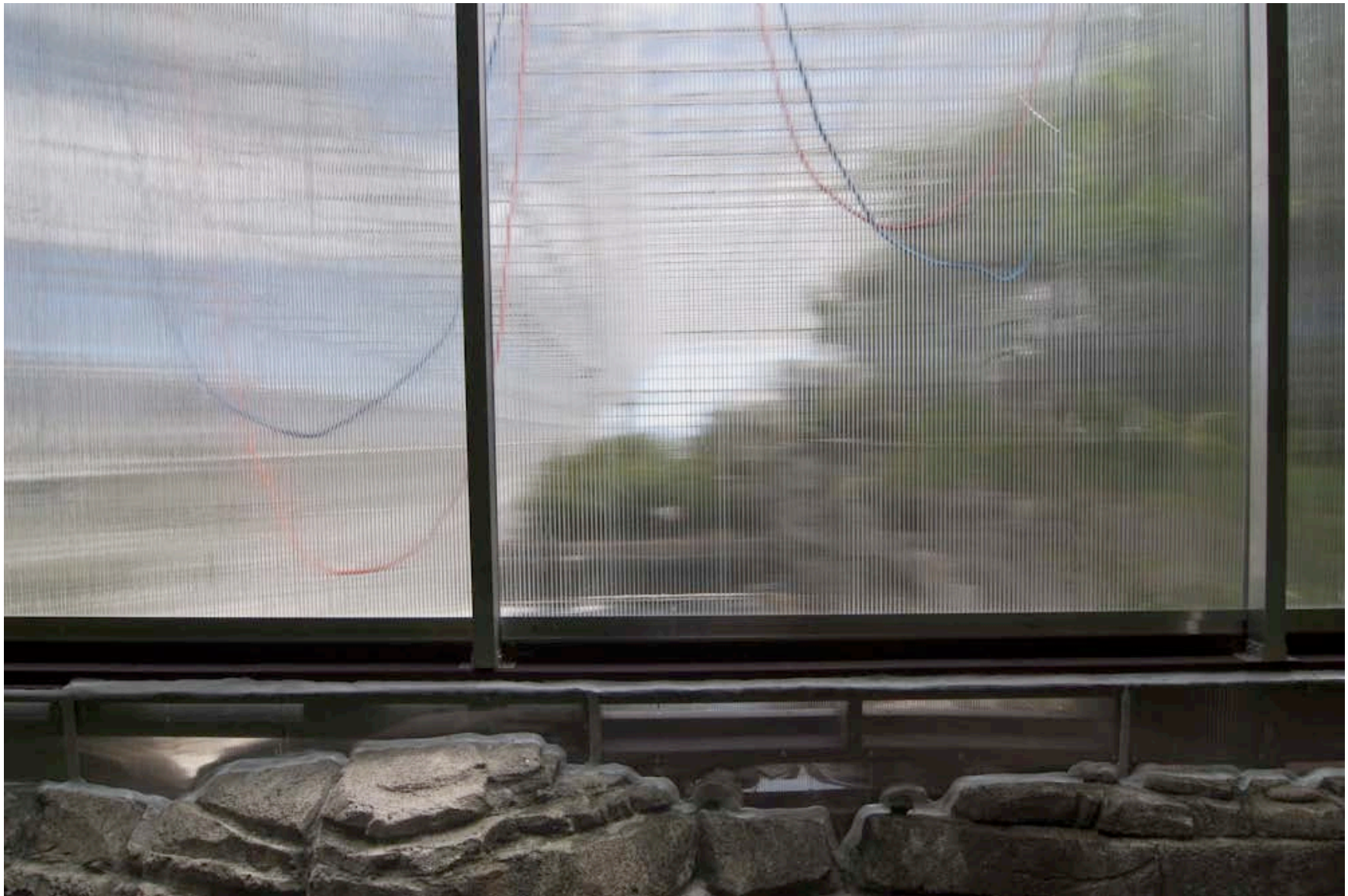
Rain Forest Wall, Biosphere 2